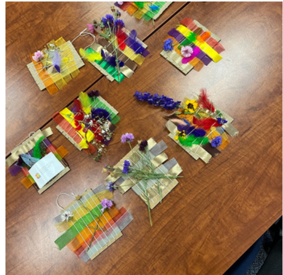
November 2024 Hosted by: The Childrens Art Studio of Richmond

Our family nights are held monthly and are designed to foster bonding and connection within our community, providing a welcoming space for families to enjoy quality time together. Each session features engaging crafts and activities, led by a dedicated community member who will also share valuable resources for young children. Whether you're creating art, playing games, or exploring new ideas, there's something for everyone to enjoy. As an added bonus, we provide a delicious dinner for all attendees, allowing you to relax and savor the moments with your loved ones.