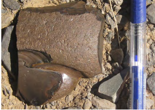
Fig. 22. Chocolate coloured chert retouched piece not associated with BH_NF-4 core