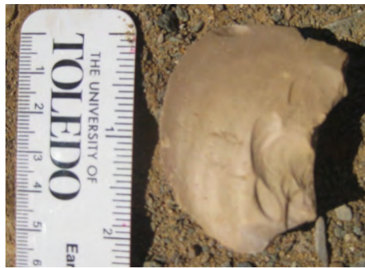
Figs. 18 – 19. BH_NF-4 :left, almost fully cortical dorsal surface of an end scraper; right, ventral surface of the same piece showing removals