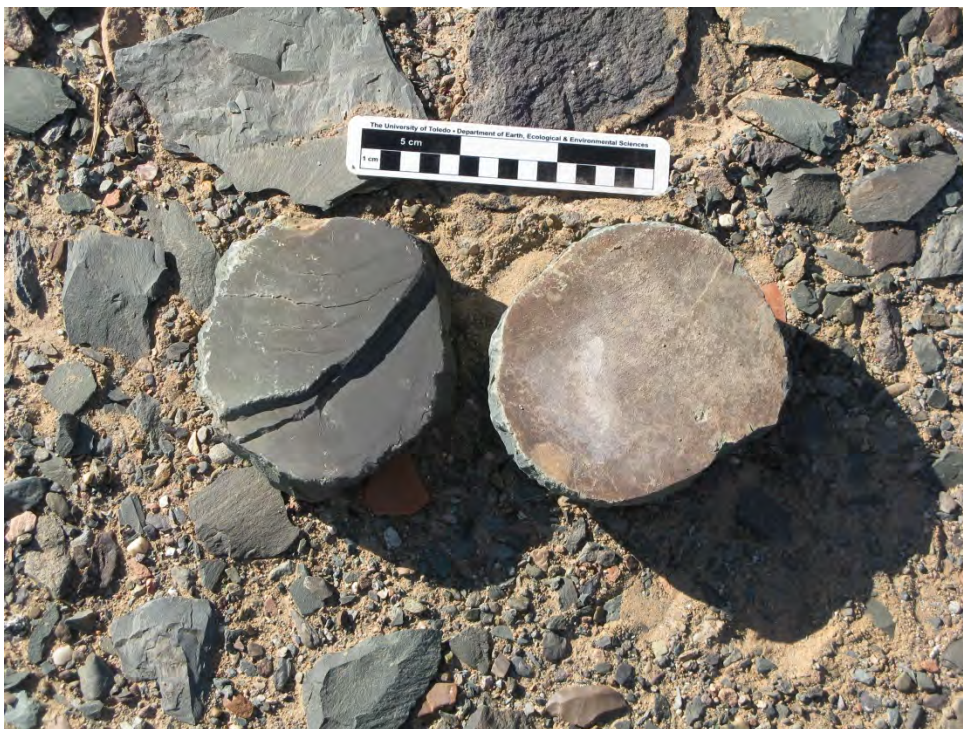
Fig 2. Blanks of small vessels, BHWK1 workshop