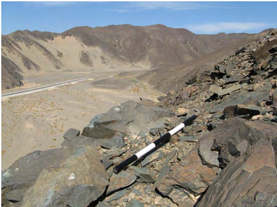
Predynastic – Early Dynastic bracelet quarry (foreground) Wadi Hammamat

Final Report to the Ministry of State for Antiquities Affairs by