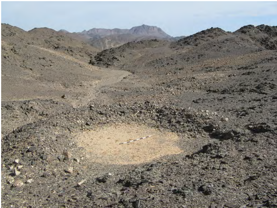
Fig. 14. BH_NCM: Copper Mine