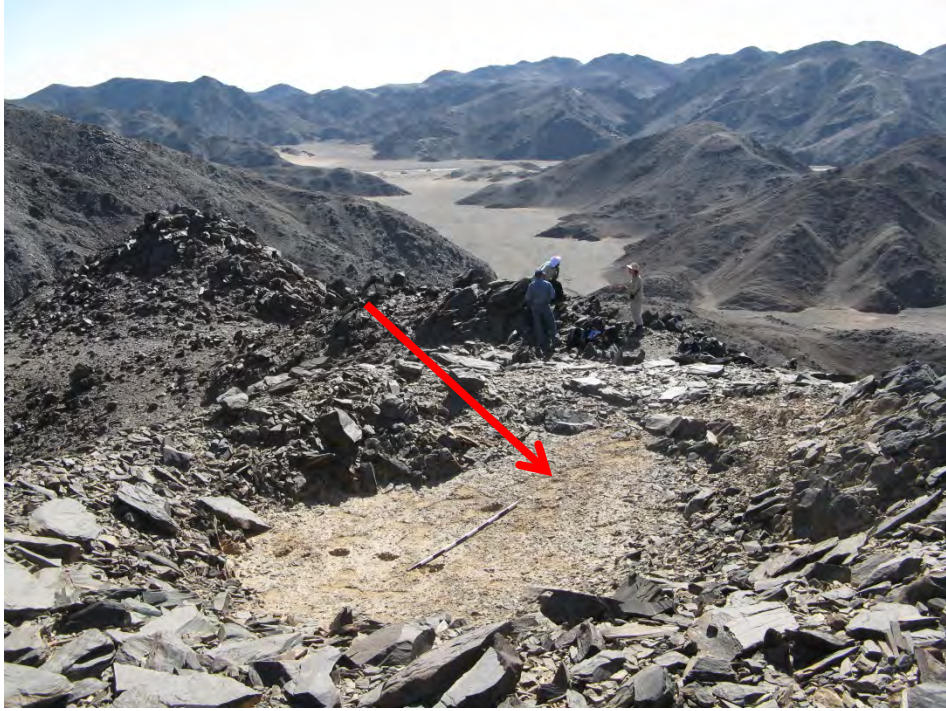
Fig 7. BH_NQ-1: Early Dynastic (?) Vessel and Palette Quarry, Bir Hammamat north of the road