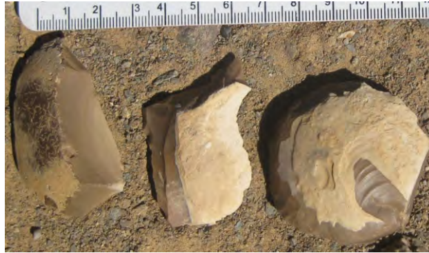
Fig. 17. BH_NF4, left – to right: unretouched flake, retouched flake with blade-like scars visible on the dorsal surface, retouched end scraper. Note the extend of cortex on all dorsal surfaces