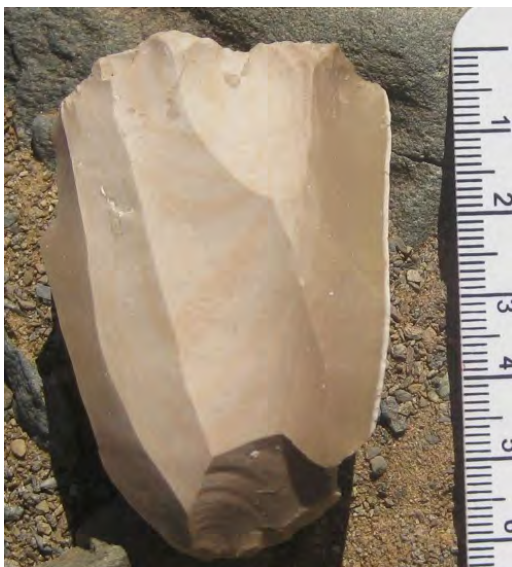
Fig. 20. BH_NF-4: blade core