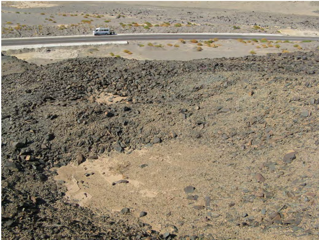
Fig. 13. BH_SQ – 12 series of quarries for small vessels and pick-like tools behind BHWK1 workshop