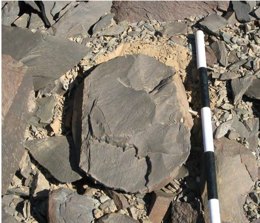
Fig. 9. Vessel blank BH_NQ-2: Early Dynastic (?) quarry