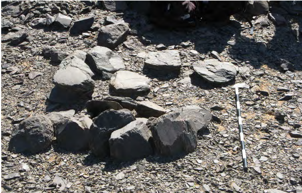
Fig 8. BH_NQ-1: Early Dynastic (?) Vessel and Palette Quarry, stockpile (?) of vessel blanks