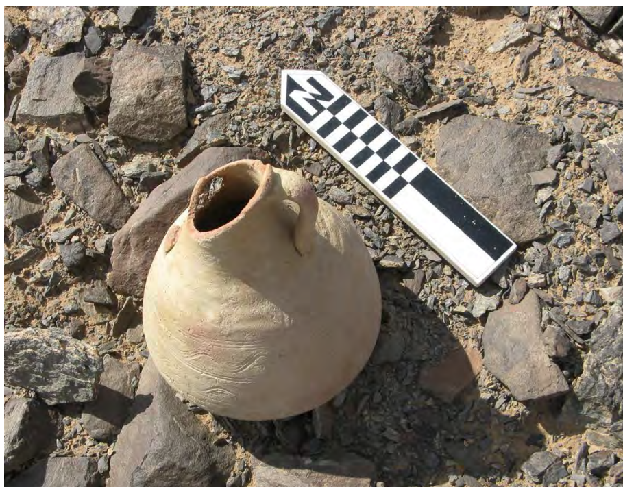
Fig. 15. Ottoman period liquid container: copper mining context – BH_NCM