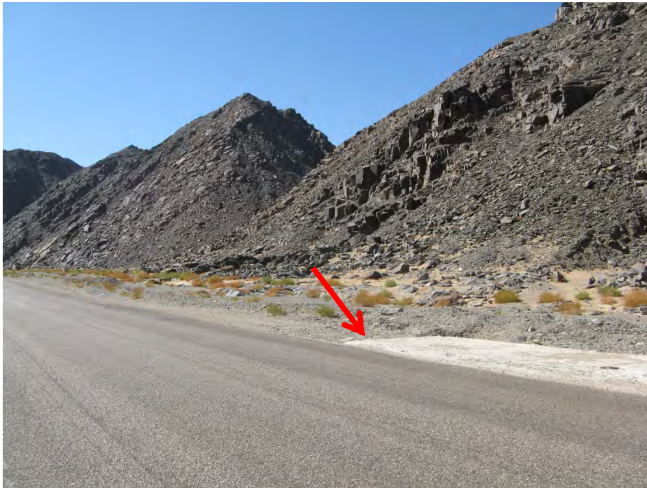
Fig 1. End of road re-inforcing (at red arrow) just before ancient settlement in the Wadi Hammamat greywacke quarries