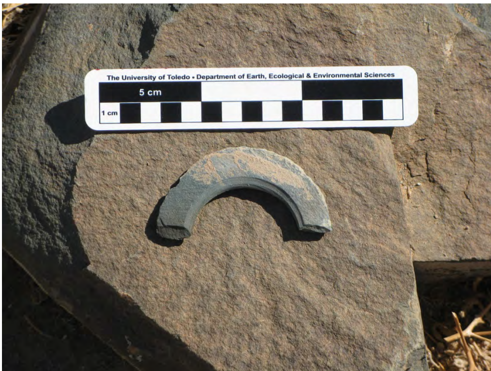
Fig 6. Nearly completed greywacke bracelet found in disturbed context near large well at BH_NF-3: Bir Hammamat wadi north of the road