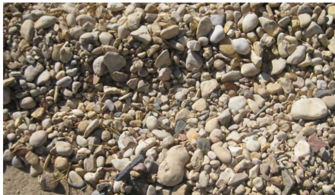
Fig. 23. Chert gravels transported for road works