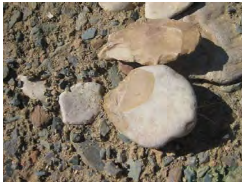
Fig. 24. Road chert pebble with removals; with recent fracture showing interior colour of chert next to ancient chert artefact