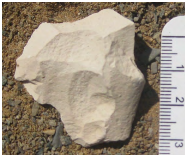
Fig. 21. BH_NF4: desilicified flake