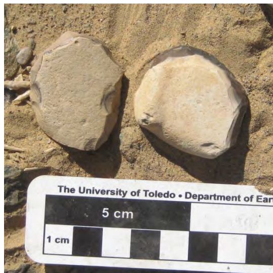
Fig. 26. BHWK2: chert end-scrapers (2011 survey)