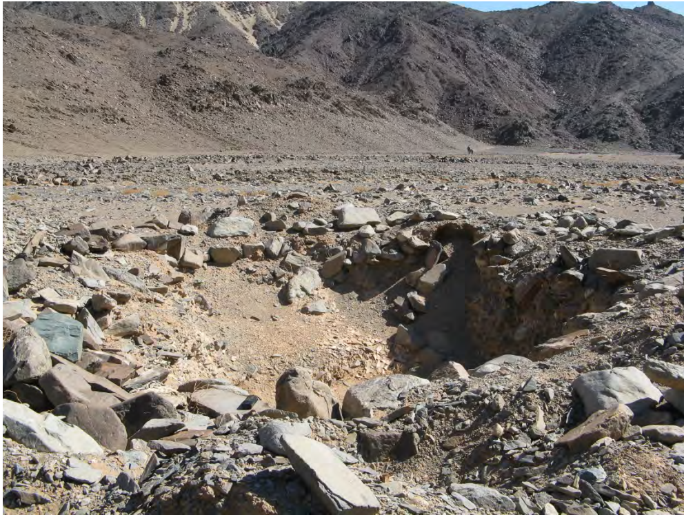
Fig 5. BH_NF-3: Bir Hammamat wadi north of the road: large well with material culture surrounding suggesting this area was also a bracelet workshop (Naqada II)