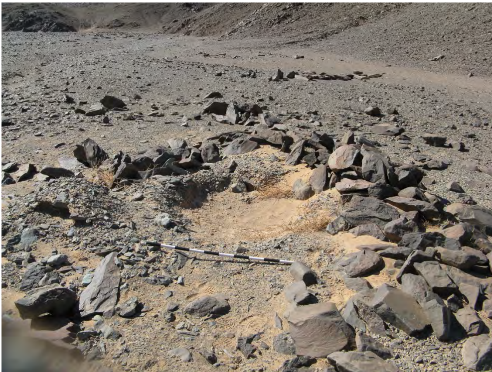
Fig 4. BH_NF-3: Bir Hammamat wadi north of the road: subterranean feature with dismantled stone walls, function unknown but could be a well given location on wadi floor