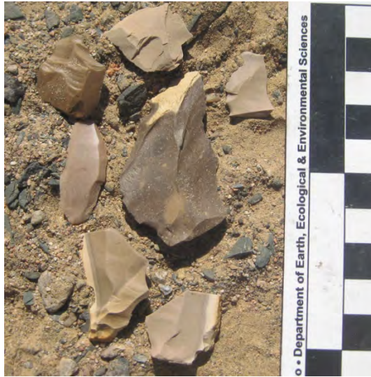
Fig. 25. BHWK1: range of chert (2011 survey)