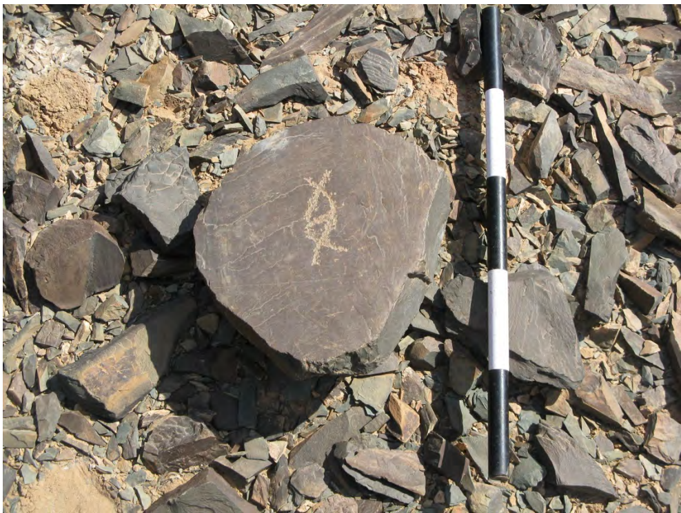
Fig. 12. BH_SQ-3: vessel showing an incised mark – could be a mason's mark?