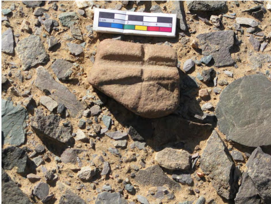
Fig 3. Silicified sandstone tool uses as an abrasive to smooth edges of bracelets; Naqada II bracelet workshop (BHWK2) Bir Hammamat