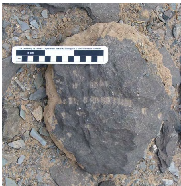
Fig. 16. Vessel blank at NQ22 showing toolmarks made by a pick-like square-ended stone tool