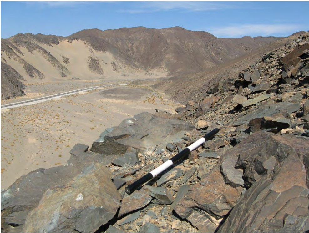
Fig. 11. BH_SQ-8: Bracelet quarry (foreground) close to Predynastic workshop BHWK1 (background)