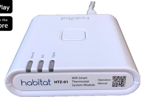
WIFI Smart Thermostat HomeLink System Module