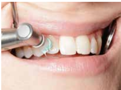
Fluoridation with Bifluorid 10 after a professional cleaning

The treated teeth are not discoloured by the thinly applied, transparent varnish. The aesthetics are not affected. Bifluorid 10 remains on the treated surfaces for an extended period of time with proper application and positive compliance from the patients. The varnish adheres especially well to enamel for a long time, particularly in vulnerable places such as approximal areas and fissures. Bifluorid 10 is economical to use and permits up to 300 applications from the 4 g bottle.