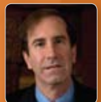
Harry Markopolos, CFA Fraud Investigator