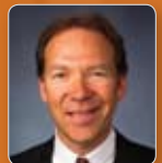
Dan Hesse CEO, Sprint Nextel