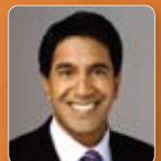
Sanjay Gupta, MD CNN Correspondent