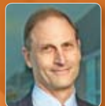
David Blumenthal, MD, MPP National Coordinator, ONC