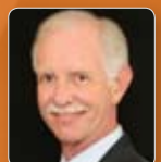
Chesley B. "Sully" Sullenberger, III Pilot, US Airways