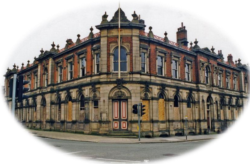
Town Hall built in 1867

The Moot Hall (Common Seal) finds itself on much of Wigan’s Mayoral Regalia such was the identity of this former building of Wigan for many decades. It was always an unofficial town seal and only came to be replaced in 1922.