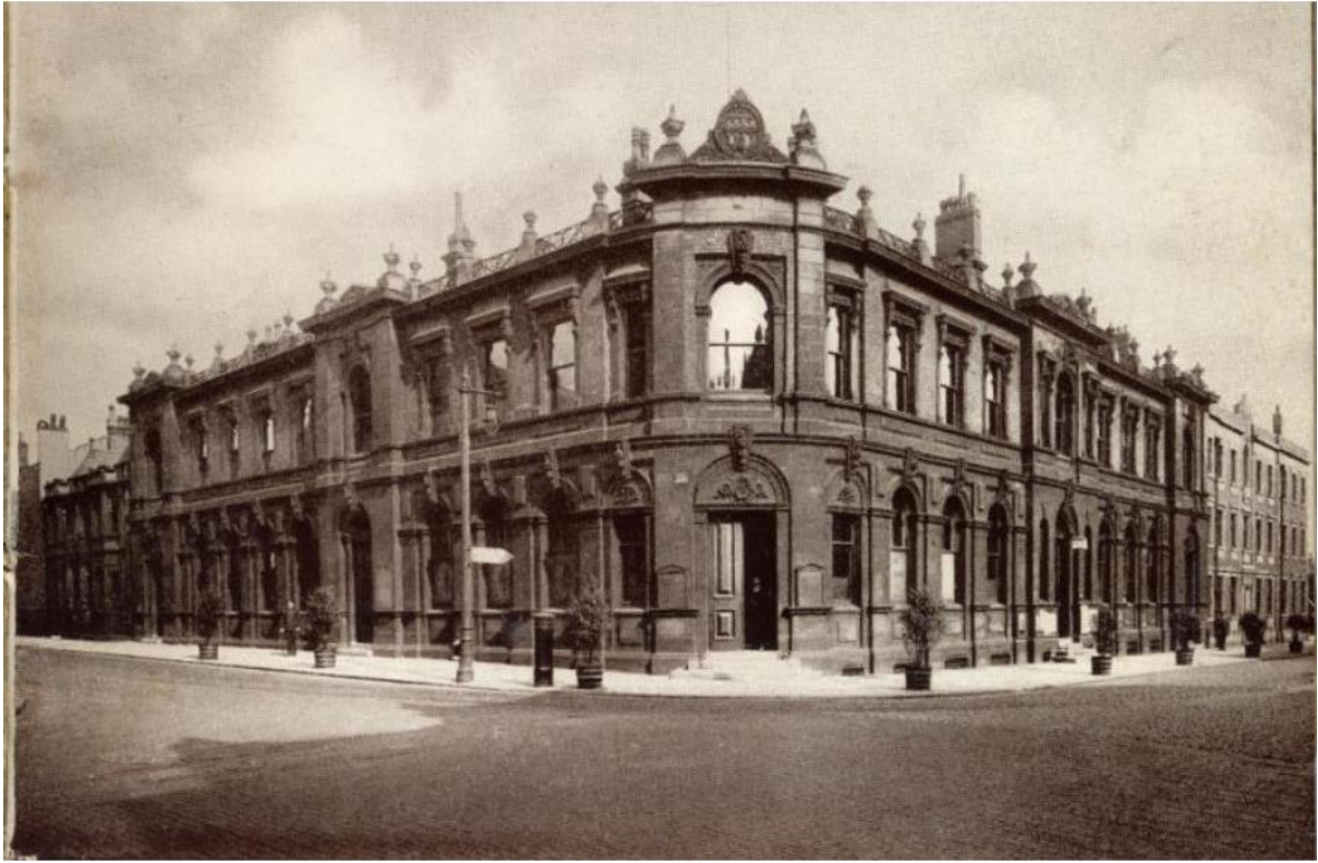
Town Hall – 1940's

The Common Seal (MootHall) was incorporated over the Main Entrance at the junction of Rodney St and King St (see above)