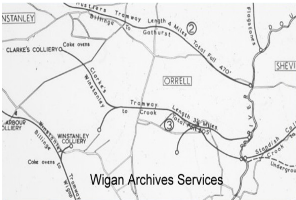
Wigan Archives Services

The map below, shows the tramways from Orrell and Winstanley to the canal at Crooke. This includes Clarke's tramway, which was the line, which Dalglish's walking horse first pulled the coal from pit head to canal in 1812.