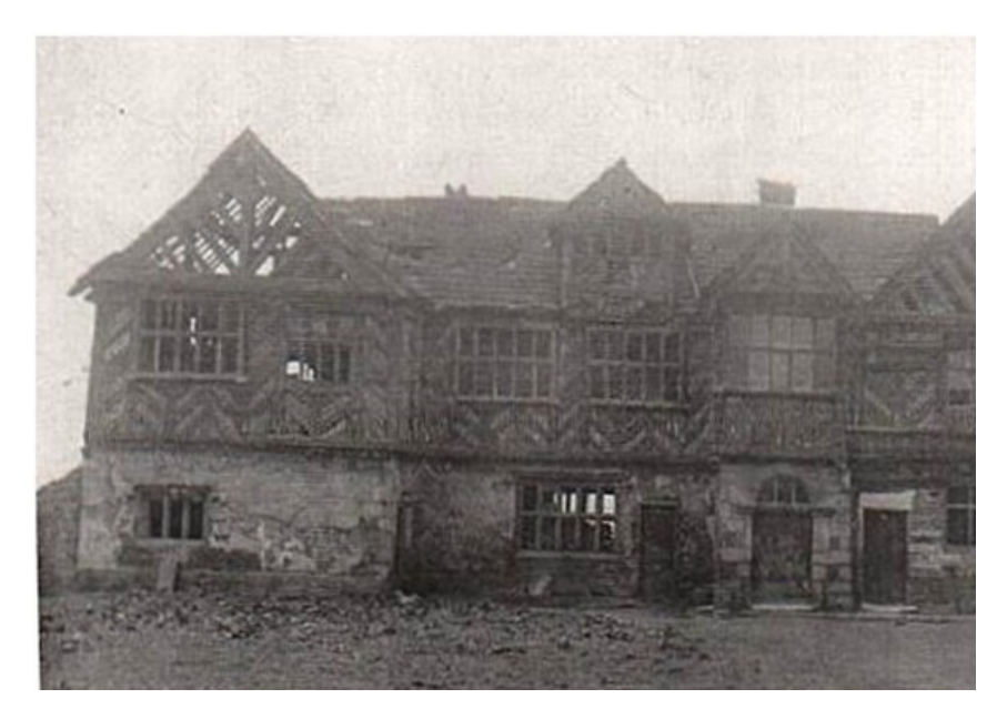
Above - The Hall before demolition, below during demolition