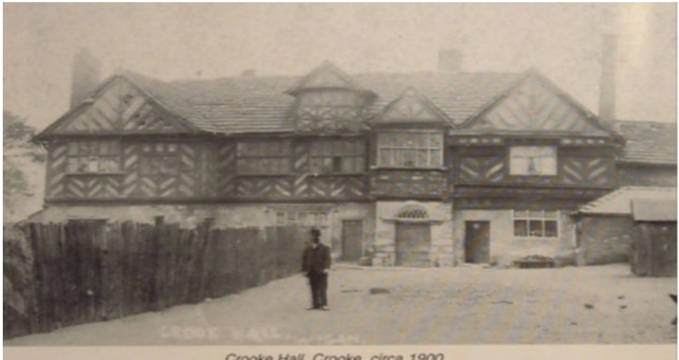
Crooke Hall, Crooke, circa 1900.

Crooke Hall, the former seat of the Catterall family, stood on low ground on the north bank of the River Douglas just west of Wigan, in what was later to become Crooke Village and at the extreme south-western end of the township. The canal now passes between where the house used to stand and the River, and the surroundings were desolate and sordid owing to the working of collieries in the immediate neighbourhood. As the coal industry took off around 1800 so from 1840 onward a colliery village sprang up to the north and west of the Hall. The house was demolished in 1938 as the ground had sunk below the water table due to mining subsidence