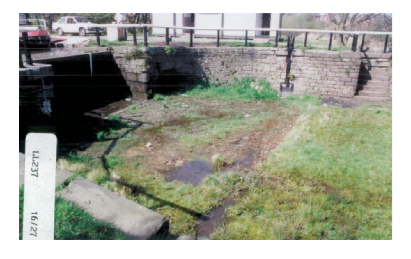
Dock at Parbold looking towards the 'Rose of Parbold' on the left 1994