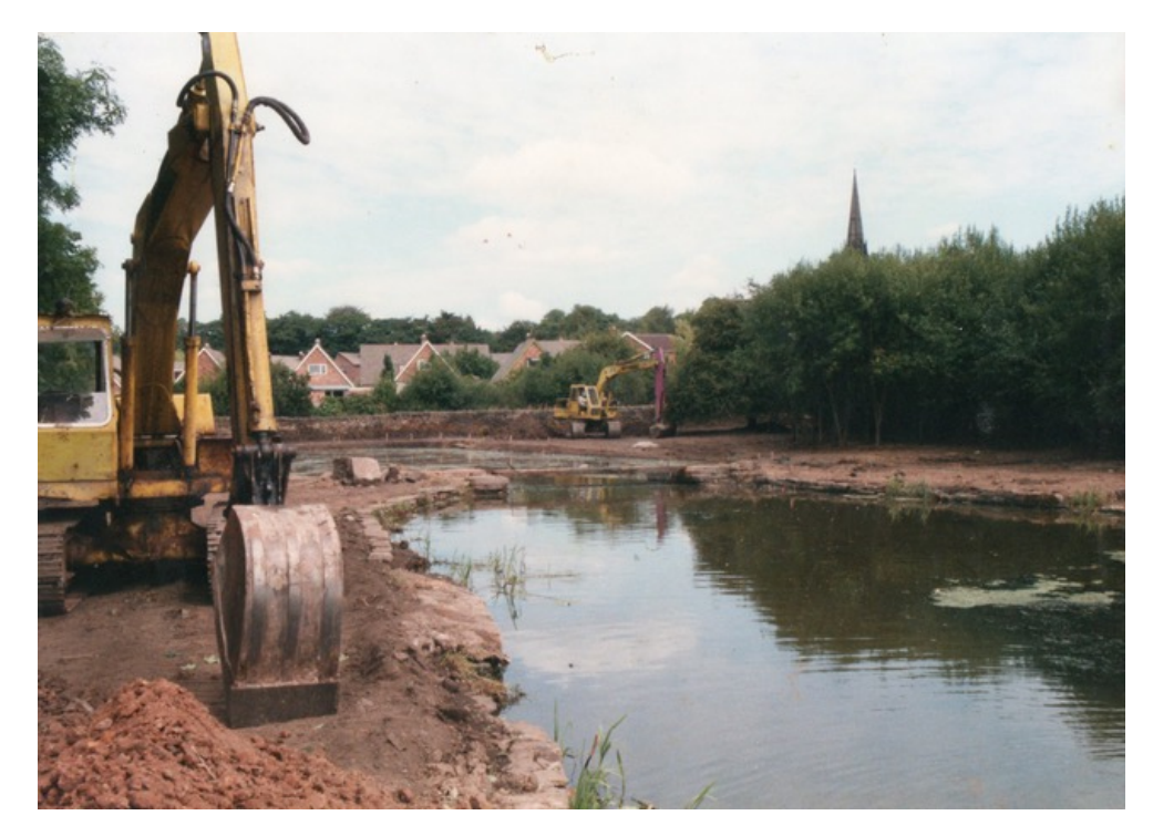
Dock in Water 1990