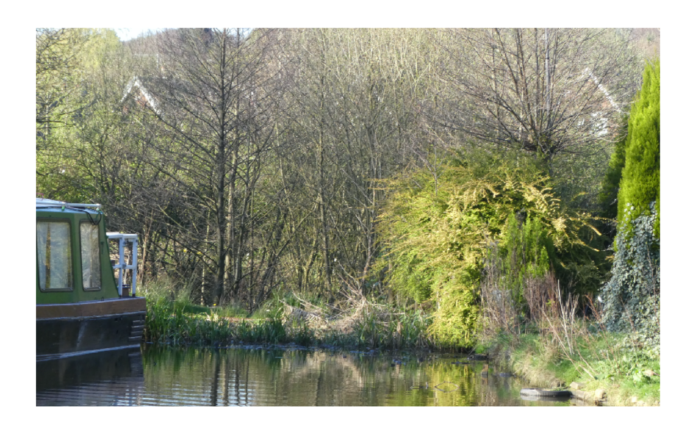
Dock at Parbold 2017 - Barge 'Rose of Parbold' on the left hand side