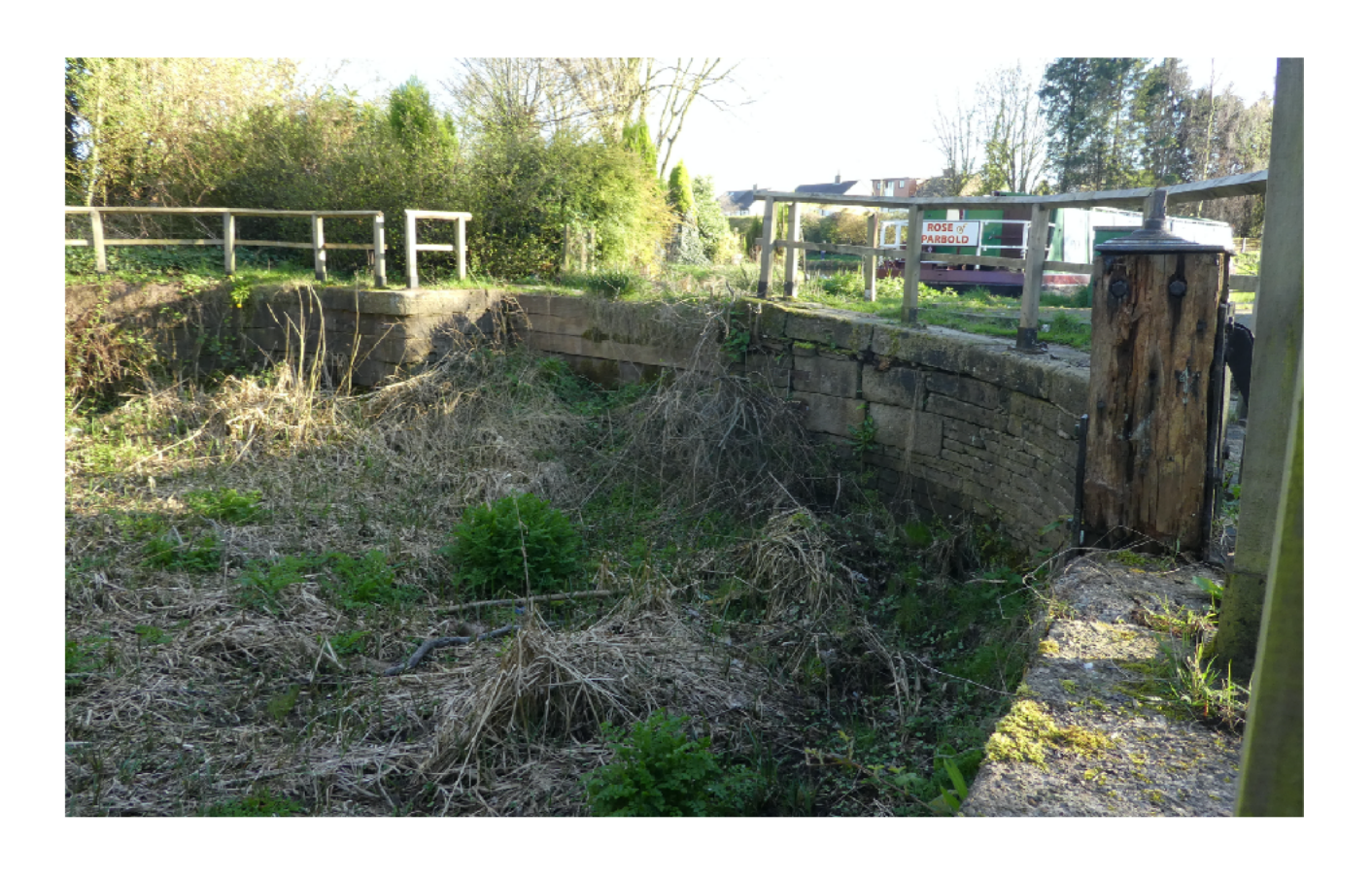
Dock at Parbold looking towards the 'Rose of Parbold' on the right 2017