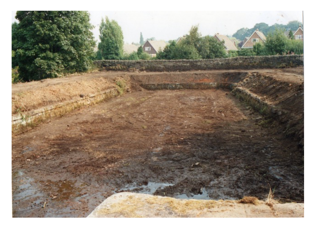
Dock Prior to Flooding 1990

The basin was restored to a working dry dock in 1990 funded by a European Social Grant and Lancashire County Council as part of a training scheme which included the purchase of the 'Rose of Parbold' - after this restoration the Dock was used to fit out the Rose which was delivered to the site as a shell. The dock was owned by British Waterways and for a period maintained by the 'Rose of Parbold" charity until British Waterways following Health and Safety concerns and leakage of water from the canal into the brook retook responsibility for the dock - a clay bund was constructed on the canal side of the stop planks to minimise leakage into the dock. No further maintenance took place over the following 20 years, Nature took its course and the basin became overgrown with trees and other vegetation.