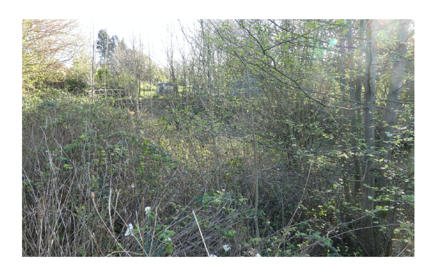
Dock at Parbold looking towards the 'Rose of Parbold' on the left April 2017