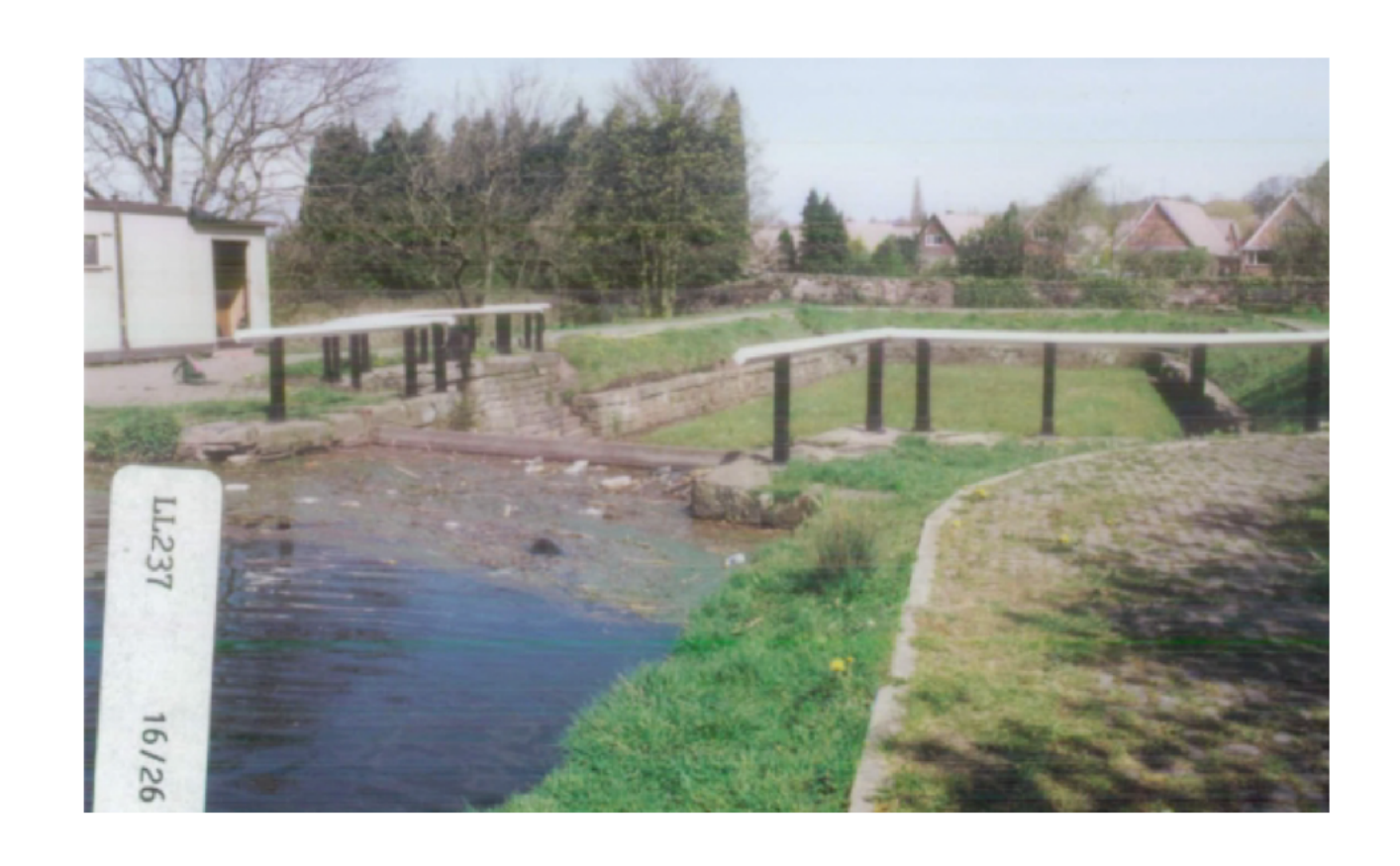
Dock at Parbold - As it looked in 1994