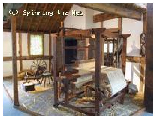
Fig 5, Hand loom Ref Spinning the Web www.spinningtheweb.org