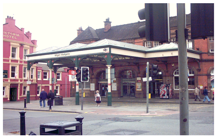
Fig 2, Wigan Wallgate Station. The red brick fronted Victorian station complete with the original cast iron canopy still serving Bolton Manchester and Southport. (K Scally)

As the coal production increased more efficient ways of transporting coal from the pithead to the canals were required, horse drawn rail wagons were developed in the latter part of the 17<sup>th</sup> century ferrying the coal and cannel directly to the barges. These colliery wagon ways were to be the forerunners of the rail network and Wigan became a criss-cross of branch lines as the collieries sought direct routes to the canals. It is also worth noting that the locomotive the Yorkshire Horse built by Robert Dalglish in 1812 at the Haigh foundry for hauling the coal wagons from Clarke's Orrell collieries to the canal (Ref Dark satanic mills Pg 38), was possibly the first steam railway locomotive in the county. Wigan was linked to the embryonic rail network in 1832 as the Parkside branch of the Liverpool and Manchester Railway was completed giving the town total access to the lucrative markets of both those cities, and soon the town would be linked by the North Union Railway with Preston and the midlands in 1834. The first station was in Dorning Street, this was replaced by Wigan Wallgate built by the Lancashire and Yorkshire Railway