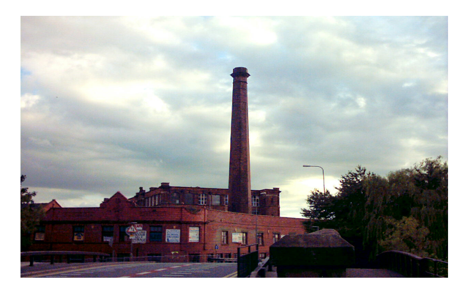
Fig 8, Farrington, and Eckersley's Swan Meadow Mills from the Wallgate canal basin (K Scally)