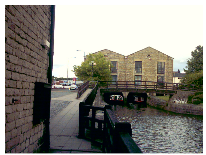
Fig 1, The No 1 Wigan Pier terminus warehouse (K Scally)

Transport could be regarded as the catalyst for Wigan's industrial transformation, although the early planning of the canal companies left much to be desired. The Douglas navigation from the Wigan Wallgate terminus to the River Ribble was planned in 1720 and completed in 1742 allowing limited access to the sea for the coal of Wigan. The Leeds Liverpool canal company, who constructed a canal from Liverpool to Newburgh, where the canal intersected the Douglas thus gaining access to Wigan, subsequently bought the River Douglas navigation as part of their ongoing plan. The Wigan section was completed in 1780 giving the town direct access to both Preston and Liverpool. The canal was completed in 1816 with the final stage linking up Wigan with the Bridgewater canal and the markets of Manchester.