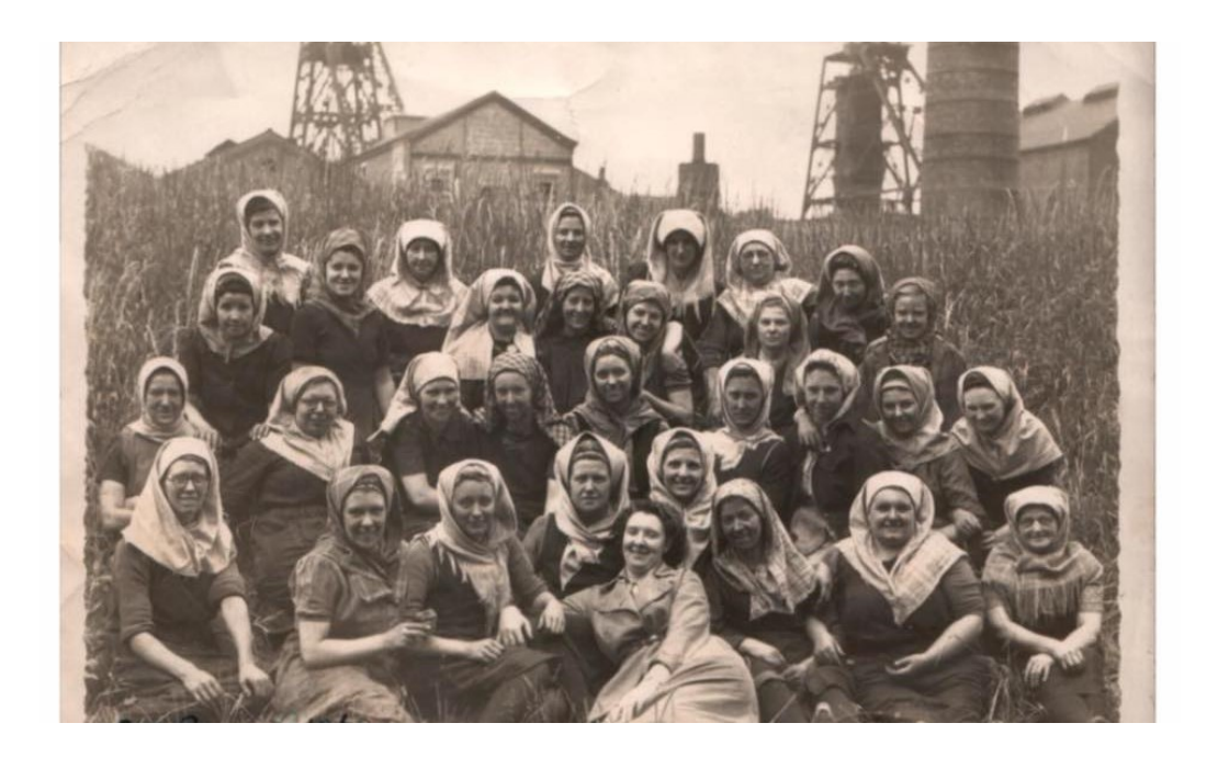
Fig 4, Wigan Pit Brow Lassies

The upsurge in mining caused a devastating impact on the landscape and ecology of the area polluting the water table, the air was filled fumes and particulates which caused health problems, trees and shrubs died because of the airborne pollution. Wigan was also involved in a social scandal reports published in 1842 cited that women, and children as young as five years old were working underground in appalling conditions. Although legislation was passed to bring women and children out of the mines and on to the surface, the practice continued in Wigan even with intervention from E W Binney of the Manchester Geological society on the governments behalf, the coal owners cited the hardships a reduction in wages would inflict on their workers families (Ref, Wigan Coal & Iron Pg 111). Later in the century children would be fully taken out of the mines and women confined to the pit brow.