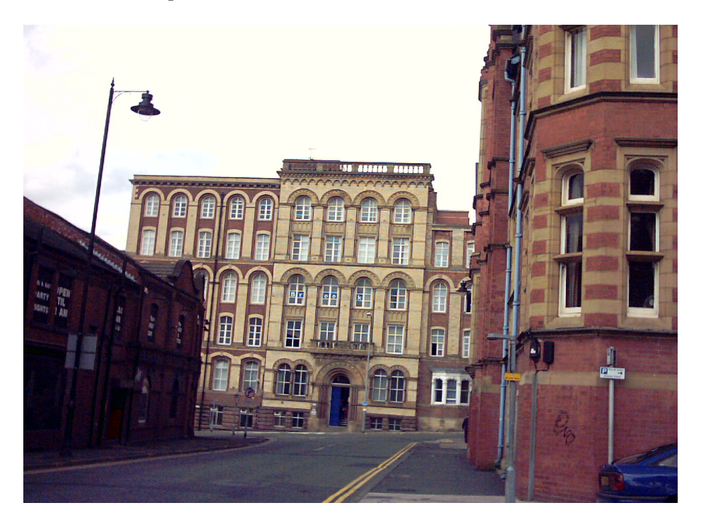
Fig 7, Coops Factory Dorning Street Wigan, one of the towns few surviving examples of this industrial style, the building to the left was the original railway station (K Scally)

emphasise the buildings lines with ornate window arches making this building one of the towns finest examples of mid-Victorian industrial architecture.