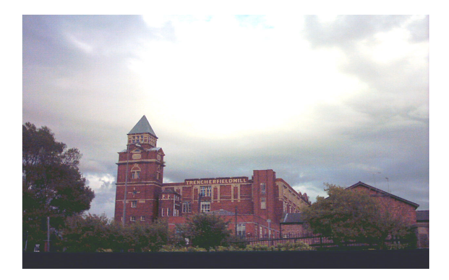
Fig 6, Trencherfield Mill Wallgate, rebuilt three times as textile technology and building methods improved. Has the largest working steam engine in the country now employed as a working Museum. (K Scally)

As the population increased the housing that was provided for these workingclass areas was mainly back to back terraces (terraced houses with only one outside facing wall and only one entrance). Another type of housing quite widespread in Wigan especially in the town centre were the yards or courts. Situated behind streets. These yards contained a jumble of hovels constructed in a haphazard fashion. In many cases these yards were unpaved and without drainage with no sanitary provision whatsoever. Overcrowding was rife in these working-class areas. Wigan's form and fabric had undergone a massive transformation "for here mills and factories appeared in large numbers, and around them hundreds of dwellings had been thrown up to house their workforce. Many fine old buildings were gobbled up in the advancing tide, forcing their owners to move out to the suburbs leaving the old pre-industrial town, apart from its very core to become enmeshed in a multitude of courts terraces and back to backs. Cramming was inevitable and widespread" (Ref Those Dark Satanic Mills Page 62). "An 1849 report described 45 small two roomed cottages in Barracks Yard off Wallgate in Wigan. There were 257 inhabitants and thus an average of three people in each room with just 4 privies in total" (Ref Those Dark Satanic Mills Page 82).