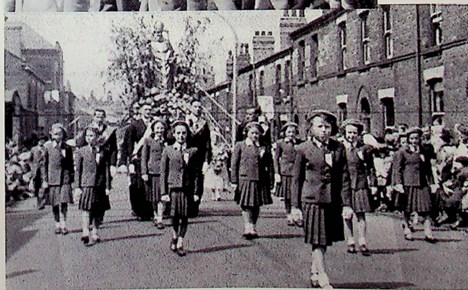
LEFT: St. Patrick's statue nears the top of Greenough Street. Excitement is rising as we prepare to enter the parish.