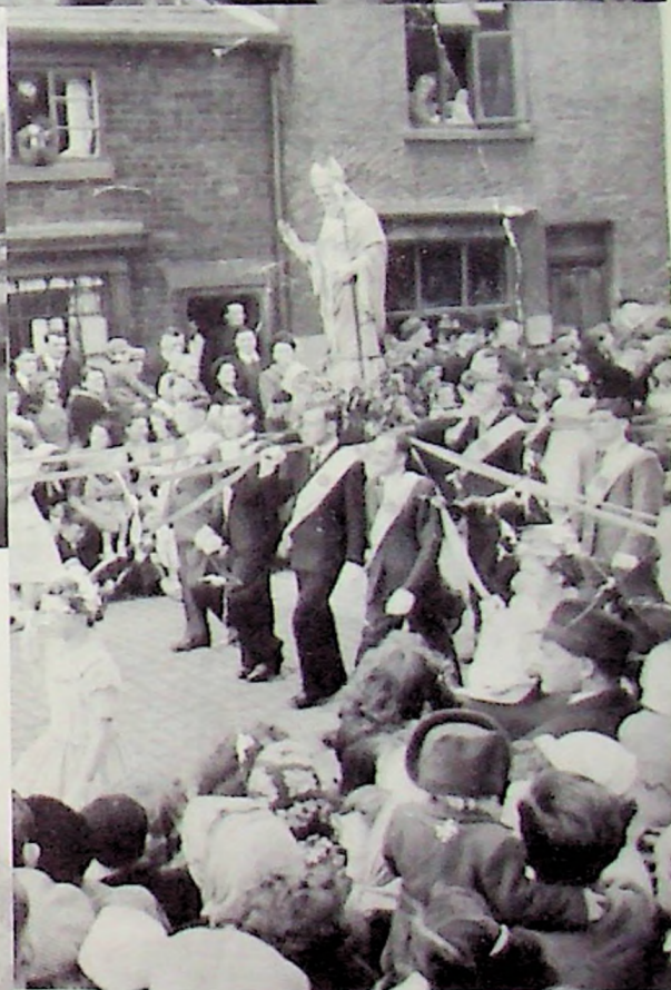
RIGHT: St. Patrick's statue on Wellington Street in the Fifties.