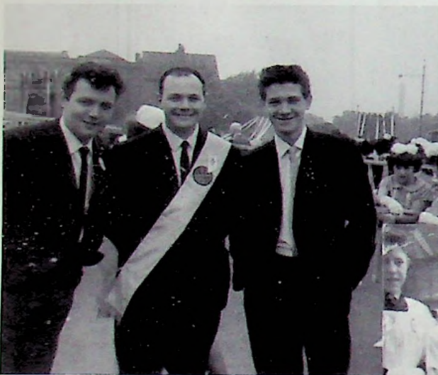
BELOW: Three stalwart young men of the parish in 1960.