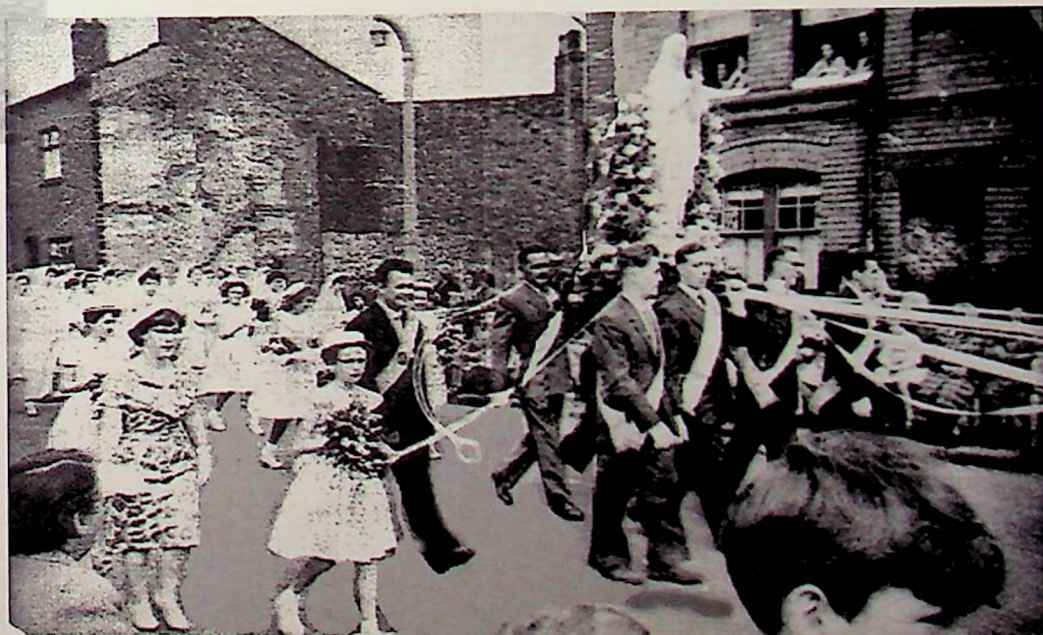
RIGHT: Is that Vauxhall Road that Our Lady's statue has just passed?