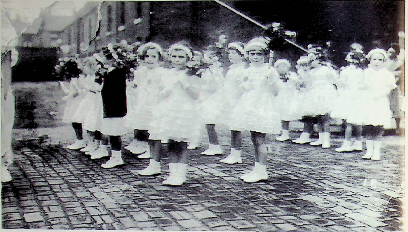
1937: A group of youngsters line up on St. Patrick Street, level with McCormick St.