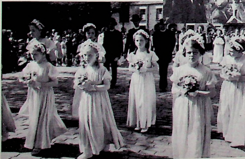
LEFT: A group of young ladies from St. Patrick's on Upper Dicconson Street, date unknown.