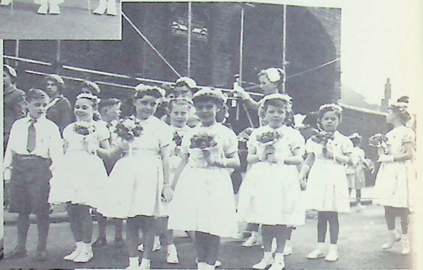
RIGHT: A group of charming young ladies with one dashing young man, wait for their marching orders outside the present church. It looks as though it could have been taken recently but actually it is from the 1950's.