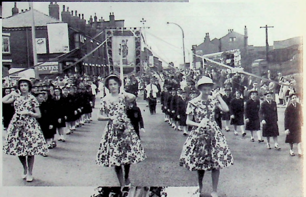
RIGHT: Slightly ahead of the crowning group, St. Patrick's banner approaches Scholes crossing probably in the same year.