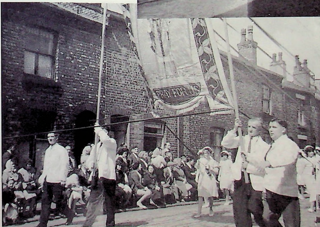
LEFT: St. Patrick's banner prepares to turn the corner into Darlington Street East.