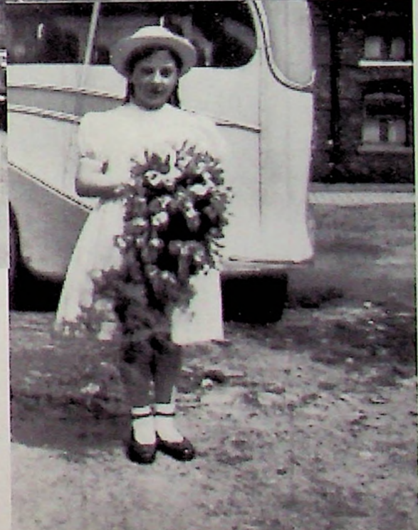
RIGHT: This young lady looks like a member of a crowning group. She is waiting on the waste ground opposite Bradshawgate with Vauxhall road in the back-ground. The coach has brought one of the visiting bands.