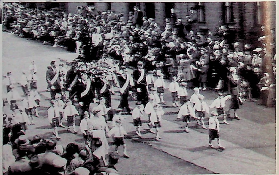
RIGHT: the Sacred Heart statue passing the convent in the early 1950's.