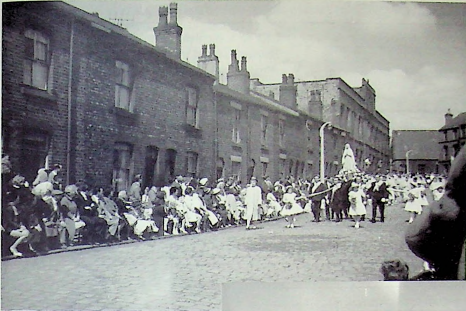
LEFT: Our Lady's statue passes down Rupert Street (date unknown).