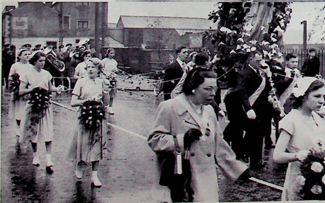
LEFT: Our Lady's Statue approaches the same spot in 1954. Notice the wet road. That's the Stanley Arms in the background facing the bottom of Hardybutts.