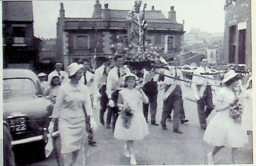
RIGHT: St. Patrick's statue returns up Hardybutts with the Stanley Arms in the background.