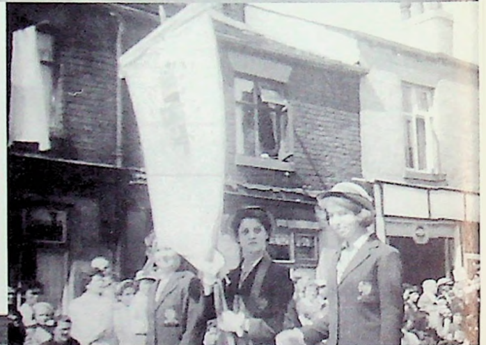
RIGHT: The Notre Dame High School banner passes down Scholes. The young lady carrying is from St. Patricks as is her companion on the right of the picture (a former May Queen).