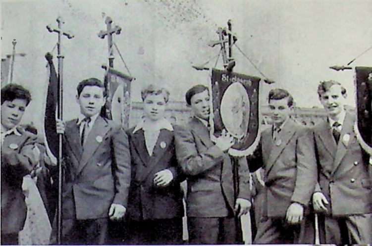
LEFT: These young men carried the banners of the Third Order of St. Francis in 1950.