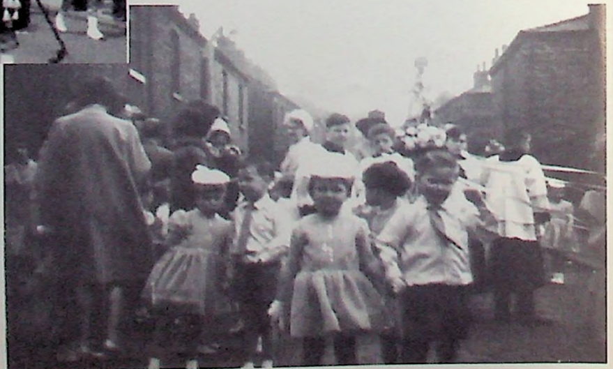
RIGHT: A group of young ladies and gentlemen wait patiently in Chancery Street early in the 1960's.