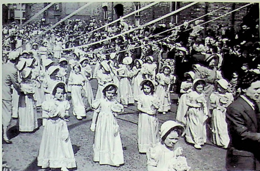
LEFT: A banner and its attendants head along Powell Street past St. John's church towards Greenough Street (Date Unknown).