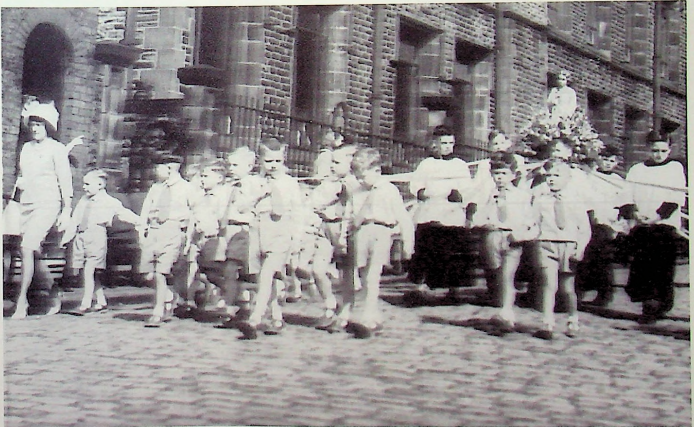
Heading down Rupert Street again. This time its in the 1960's that this group of infants escort the statue of the Infant Jesus.