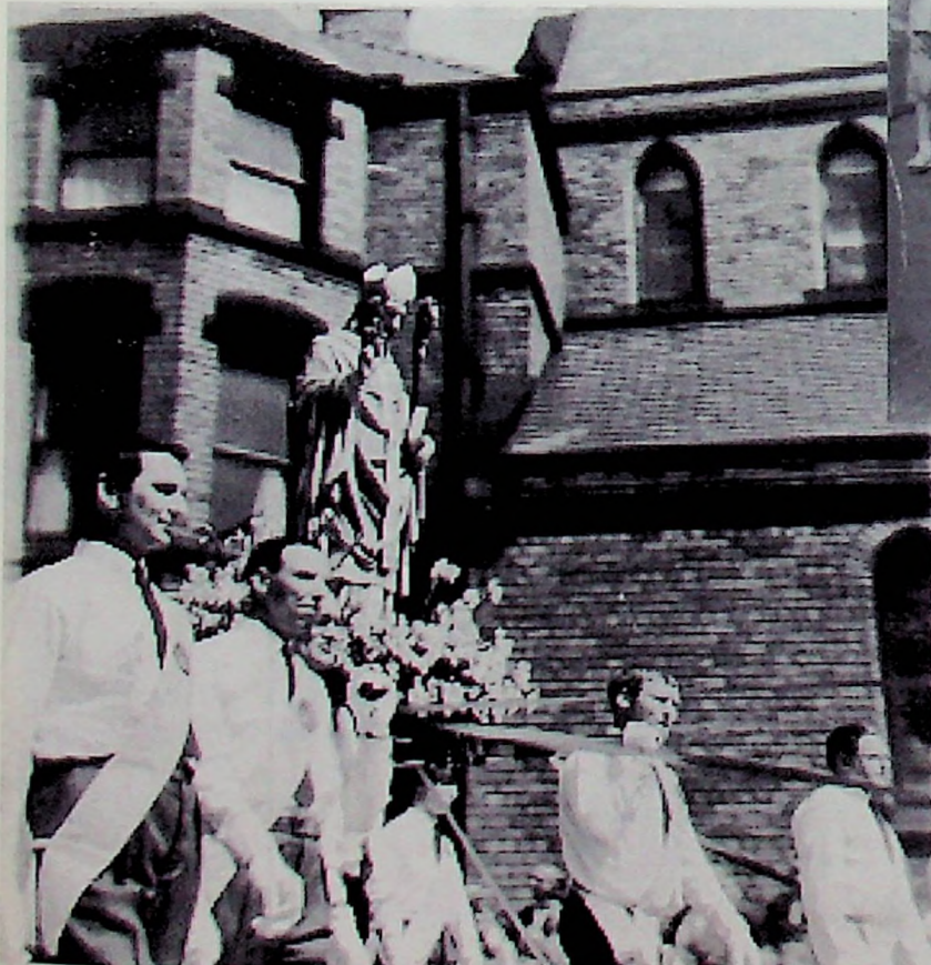
LEFT: St Patrick's Statue draws level with the Church prior to turning into Rupert Street.