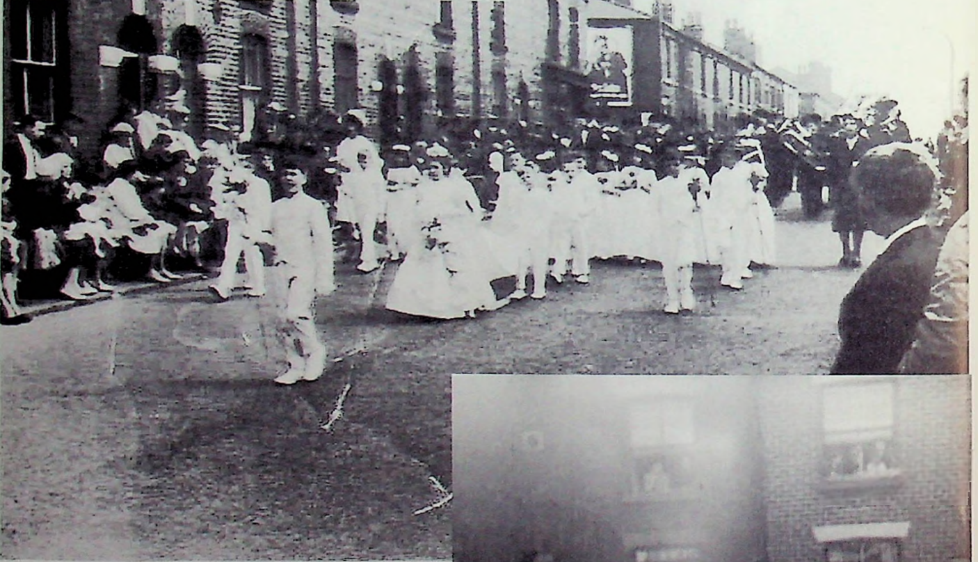
RIGHT: Young men of St. Patrick's on Darlington Street East (date unknown).