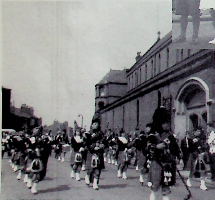
LEFT: The Blackburn Catholic Pipers who were frequent guests at the Whit Walks, warm up for some hard blowing outside St. Patrick's Church on a Whit Monday morning in the 1950's.