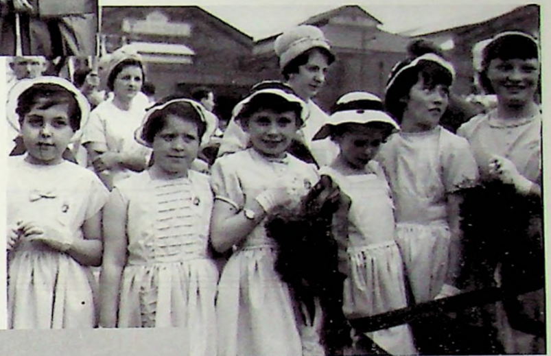
RIGHT: 1961: More pretty young ladies find time for a photo call while waiting for "Faith of Our Fathers".