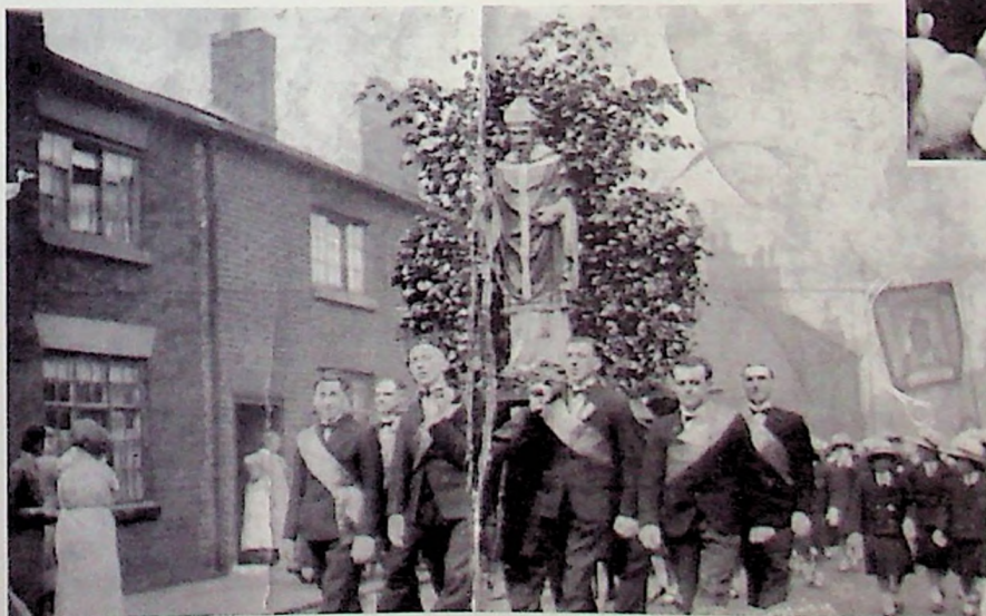
RIGHT: St. Patrick's statue on Wellington Street in the Fifties.