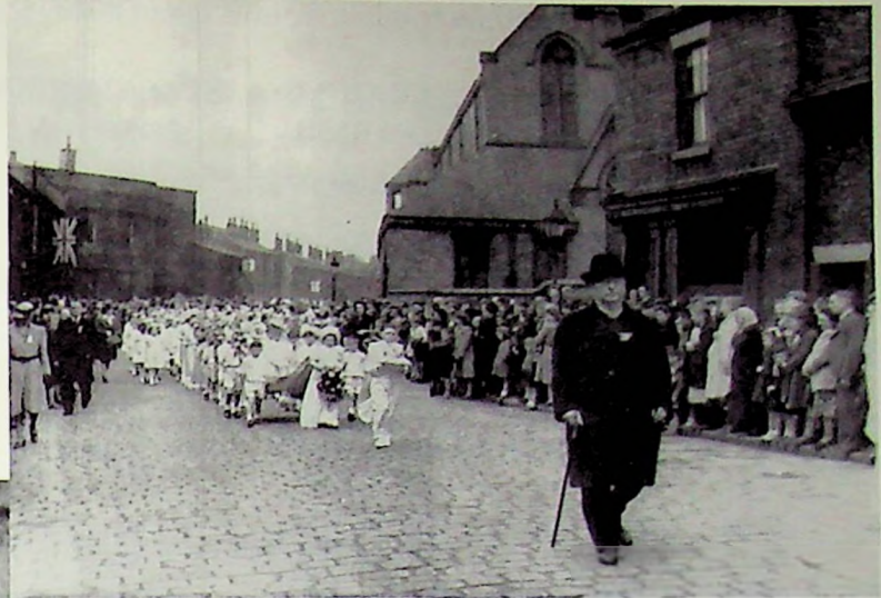
LEFT: The Crowning Group which was the showpiece of the procession.