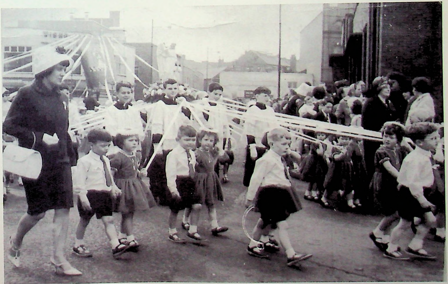
St. Patrick's Infants stride proudly on to the Market Square past the corner of the old Market Hall. British Home Stores can be seen in the background.