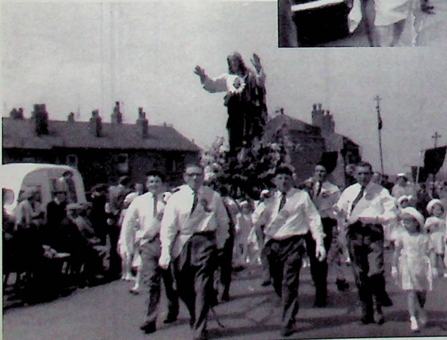
LEFT: The Sacred Heart statue arrives back home safely.