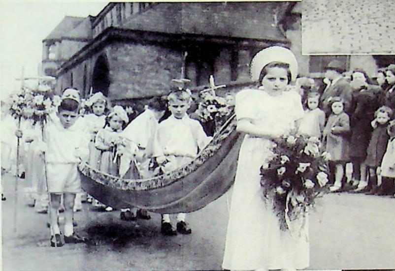
RIGHT: The boys have just passed Chancery Street with the Girls close behind them.