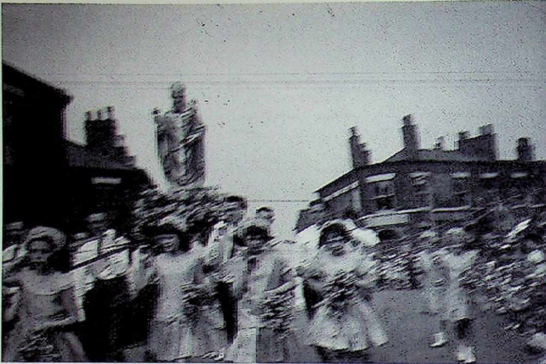
LEFT: St. Patrick's Statue turns from Wellington Street into Hardybutts. The Wigan Arms can be seen in the background.