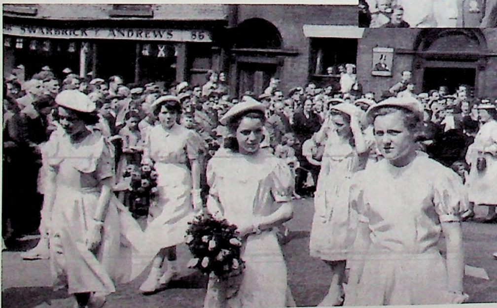
LEFT: To the strains of "Wearin' o the green", these young ladies turn from Scholes into Wellington Street.