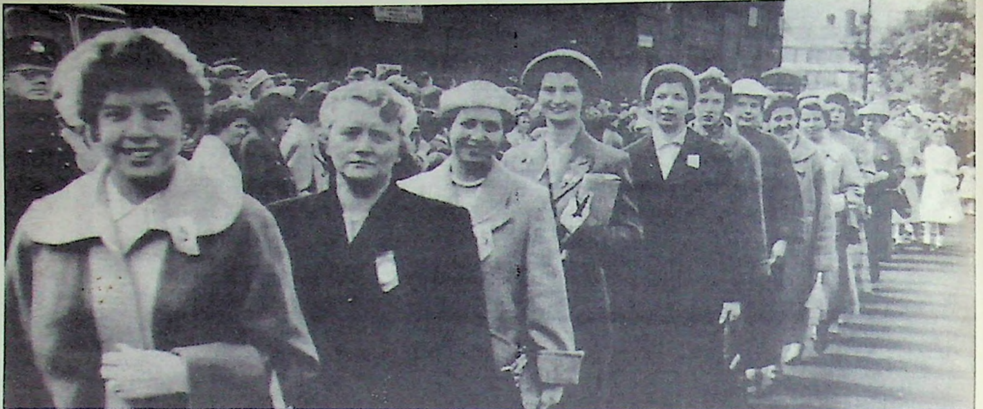
ABOVE: These ladies of the parish show good humoured dignity as they leave the market square on a Whit Walk in the 1950's.