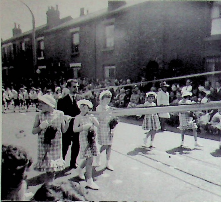
LEFT: A banner turns from Rupert Street into Darlington Street.