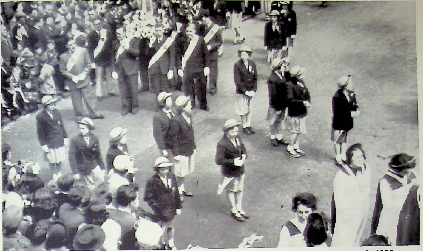
A group of Notre Dame pupils escort Our Lady's Statue on to the Market Square in the early 1950s.