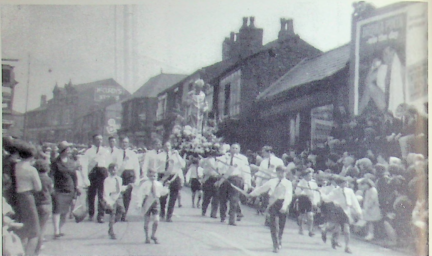
ABOVE: "Here we come!" St. Patrick's statue turns into Scholes and on to parish ground.