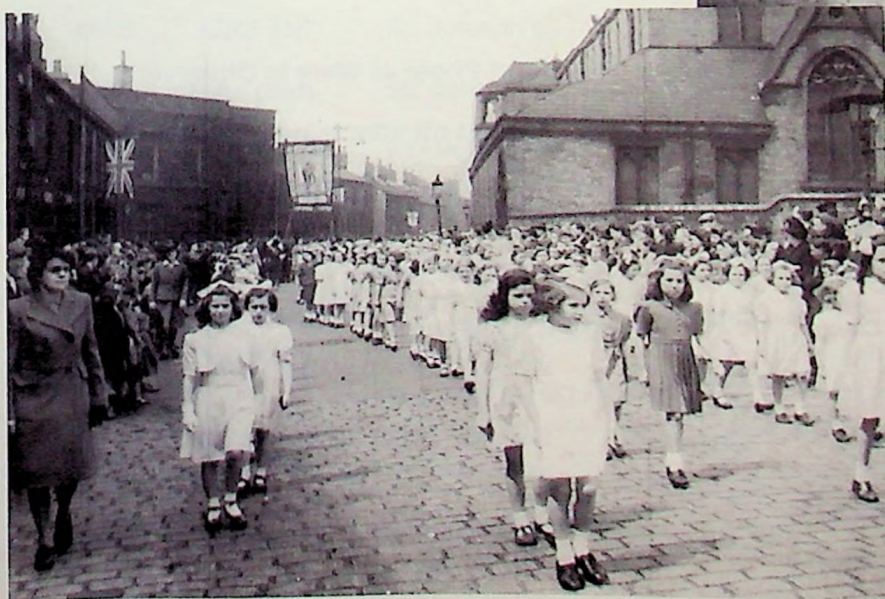
LEFT: Here come the girls. In the background is St. Patrick's Banner. The old girls school can be clearly seen and the Vulcan Arms with the Union Jack hanging from the window.