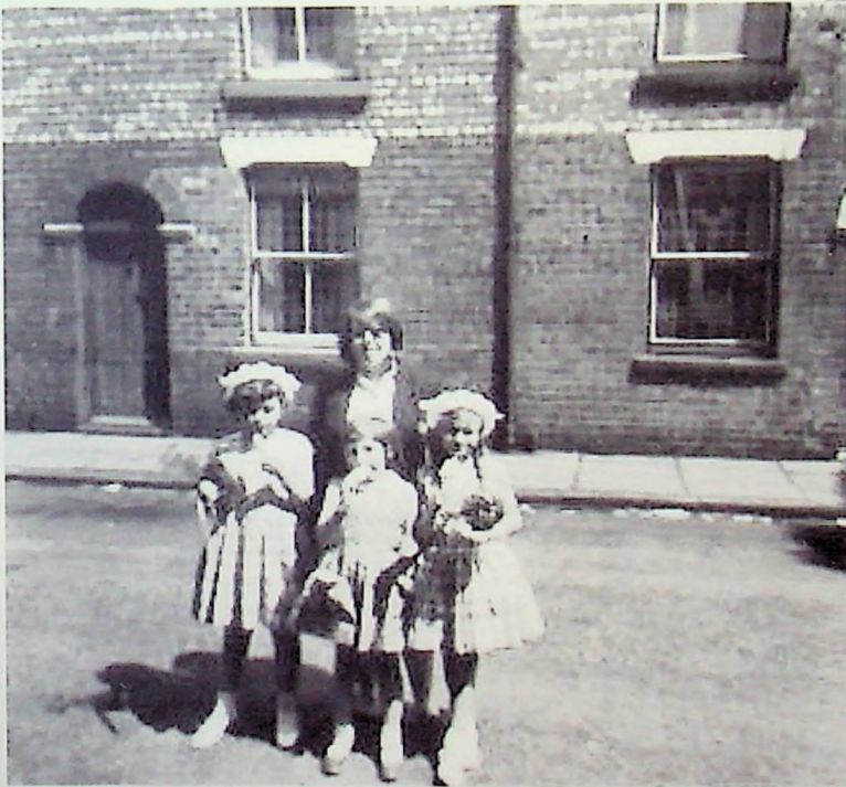
BELOW: A group of youngsters wait eagerly on Higham Steet in 1960.