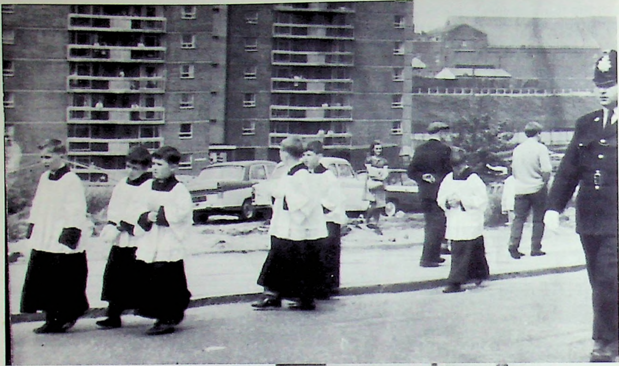
ABOVE: St. Patrick's altar boys approach the bottom of Hardybutts on their way back home.