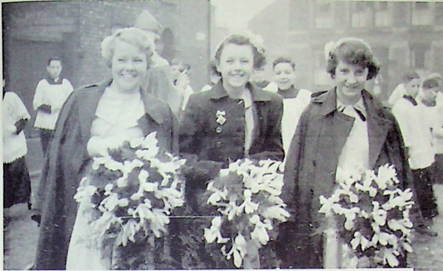
LEFT: The bottom of Rupert Street, 1954 and the rainclouds threaten the walk but the sunny smiles of these young ladies would brighten any day up.