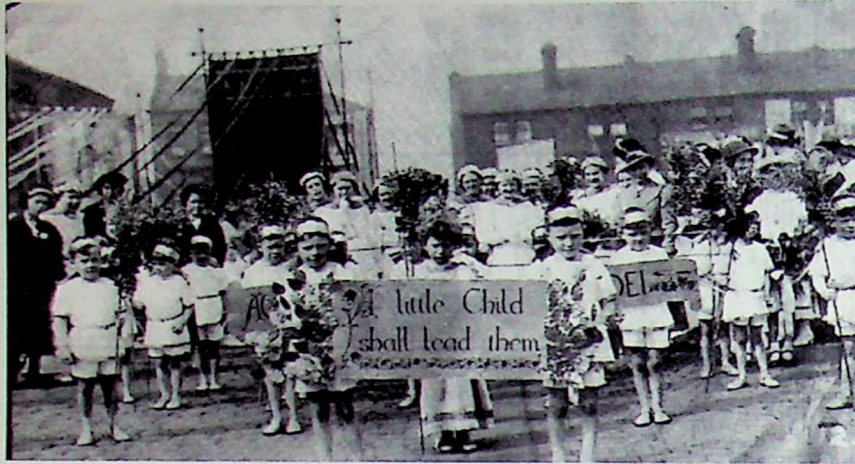
LEFT: A group of children in the St. Patrick's assembly spot in 1938.