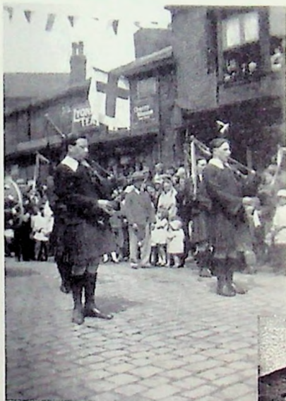
LEFT: Just where have these pipers stopped?