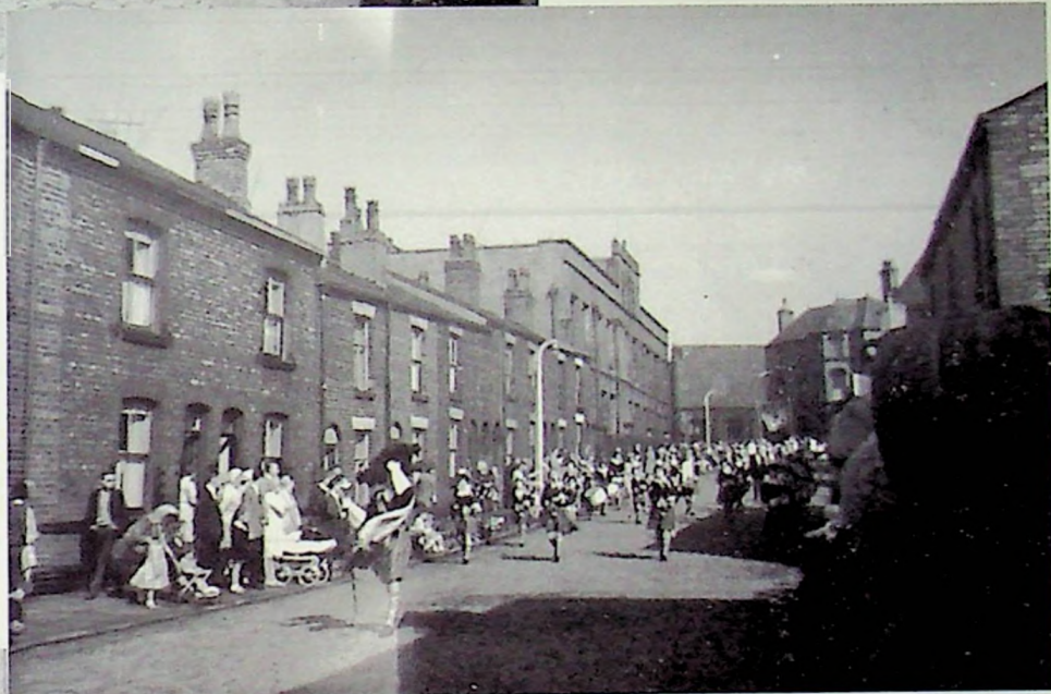
RIGHT: The drum major of a pipe band adjusts his bearskin hat as he nears the bottom of Rupert Street.