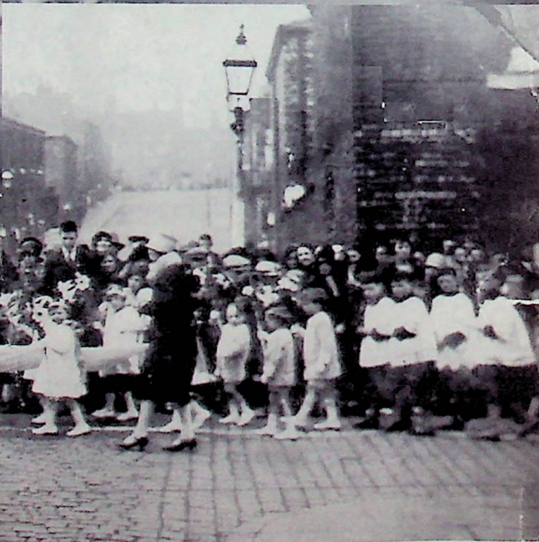
The 1928 procession moves out of McCormick Street and into St. Patrick Street.