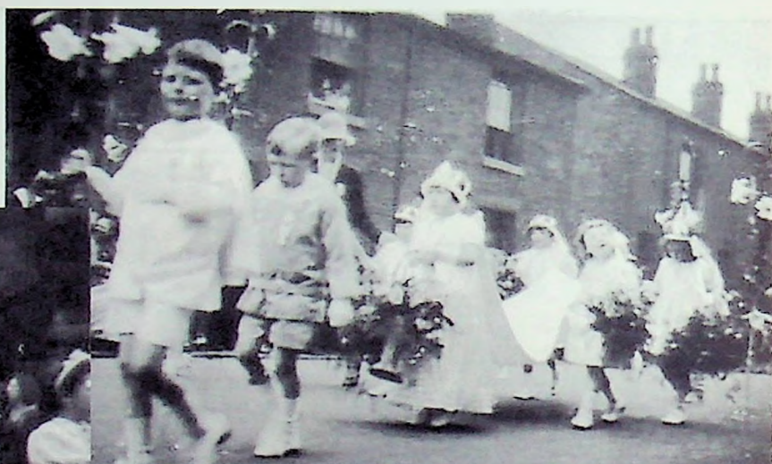
BELOW: The 1952 procession moves into McCormick Street behind the Church.