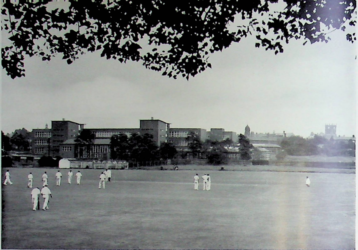
Cricket at Bull Hey