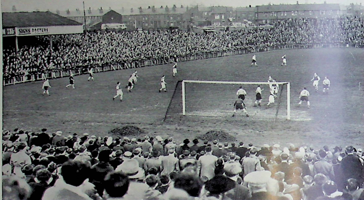
Association Football at Springfield Park

full back position. He took part in three tours of Australia and played in a record number of test matches and international matches.