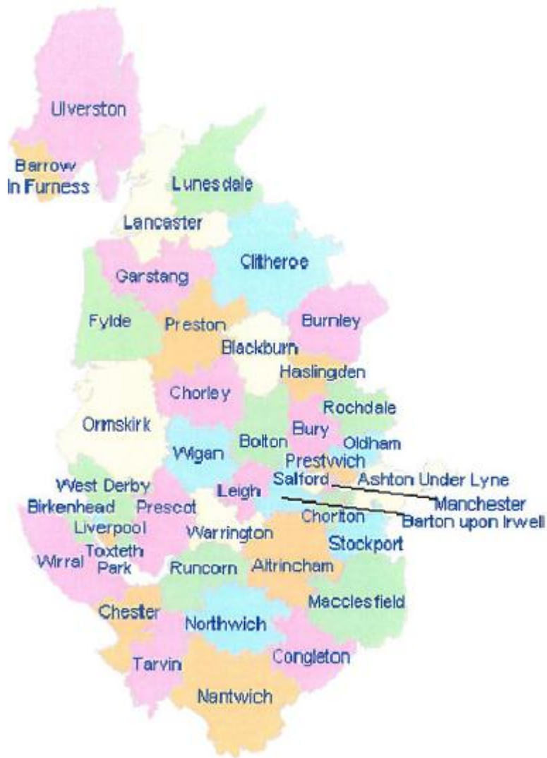
Figure 1: Poor Law Unions in North West England