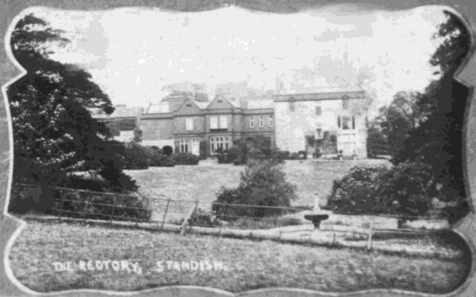
THE RECTORY, STANDISH.