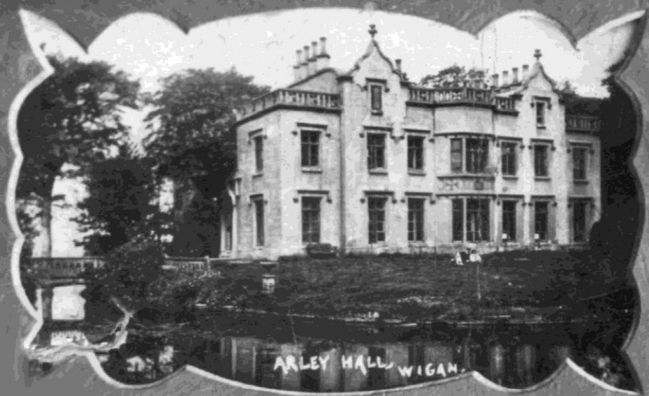
ARLEY HALL, WIGAN.