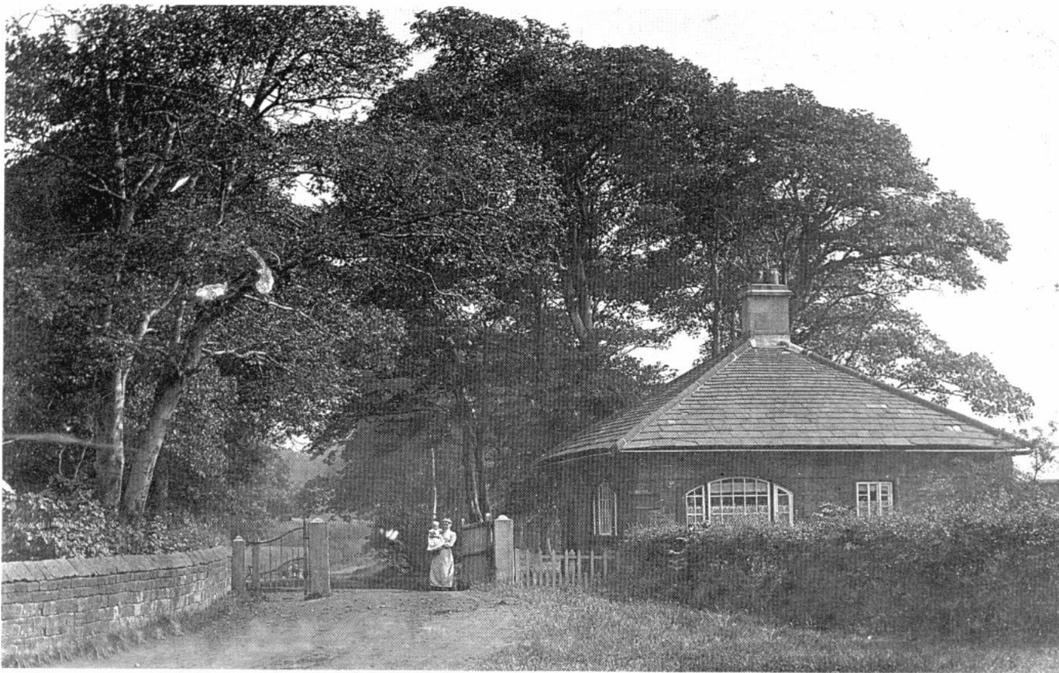
Beech Walk, Standish, circa 1910. The lodge to the right is Beech Lodge, which was the gatehouse for Standish estate.