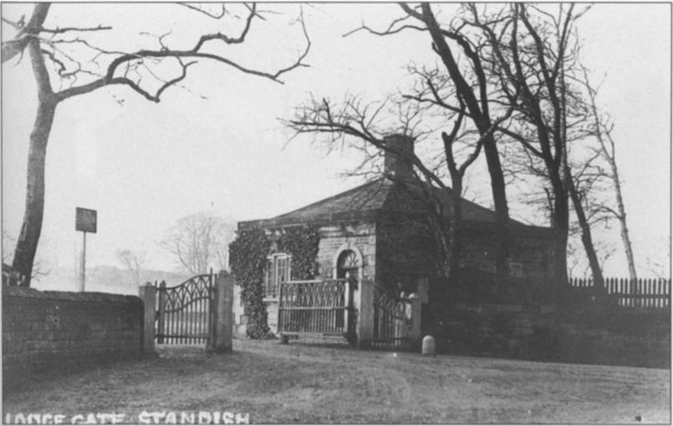
LARGE GATE STANDISH