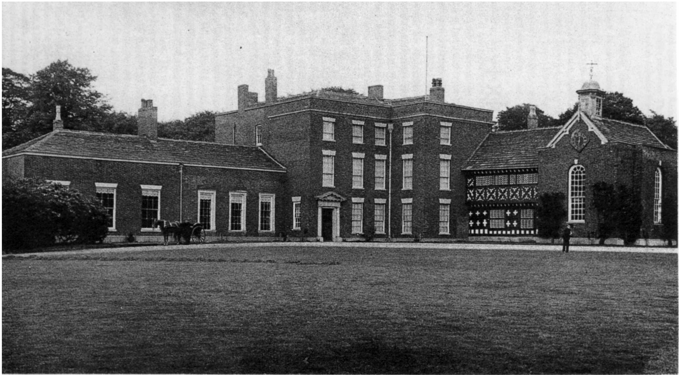
STANDISH HALL, circa 1920

Reproduced by kind permission of Manchester Central Library.