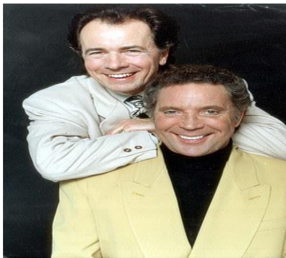
Barry and Sir Tom