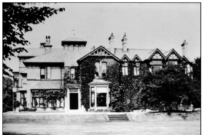
The Hollies, Wigan