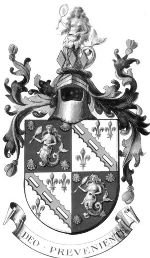
The Ratcliffe-Ellis Arms