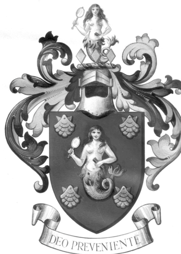
The Ellis Arms