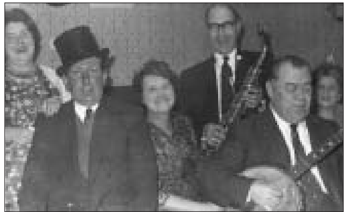
The band in the singing room.