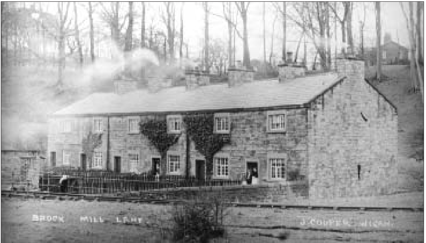
Brock Mill Cottages (now demolished) stood at the bottom of Brock Mill Lane and housed workers at the mill when it was part of Haigh Hall Ironworks.