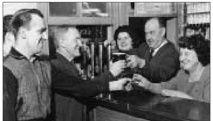
The "regulars" getting served in the vault.