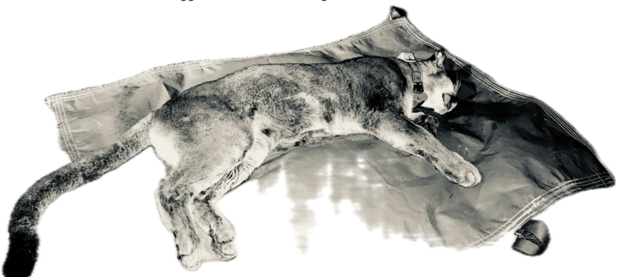
P49 - Sleeping off the drugs, latest female mountain lion to be collared and tracked

In November and in January, Quinton was able to collar 2 new mountain lions, now being tracked in Sonoma's west county. P48 was a beautiful young adult male captured through baiting in the Occidental area. Despite only being about 3 years old, he is one of the larger cats caught on the project, weighing in at a solid 55.4kg. After returning from December safaris in Africa, Quinton was able to capture and collar a new young adult female, P49, on the 25th January. It's still early days to know, but thus far her data suggests she is P39's neighbor to the east. Time will tell!