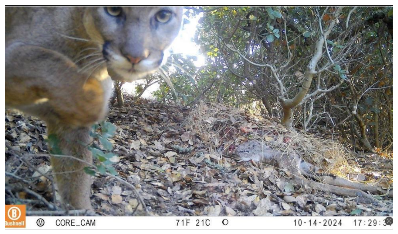
P33 giving us the eye! The deer she was feeding on is lying in the background.

A lot has happened since our last Newsletter in September - both on the mountain lion project as well as on our safaris. We hope you enjoy the update.