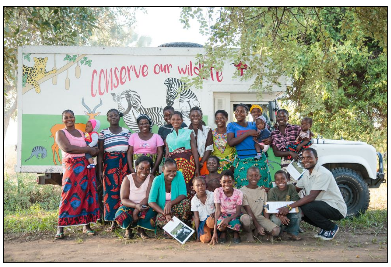
Chipembele's Mobile Education Unit