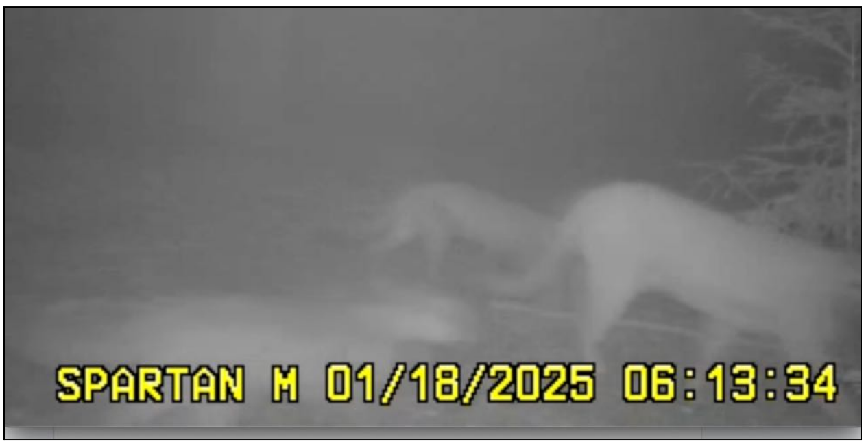
P39 with 3 cubs in tow.

The good news does not end there. Another private landowner trail camera picked up signs of P39 with all 3 cubs on the 18th January. This is wonderful news to see the cubs born on the 12th July have made it to the 6 month mark. Wishing Hetty and her siblings all the lion luck there is!