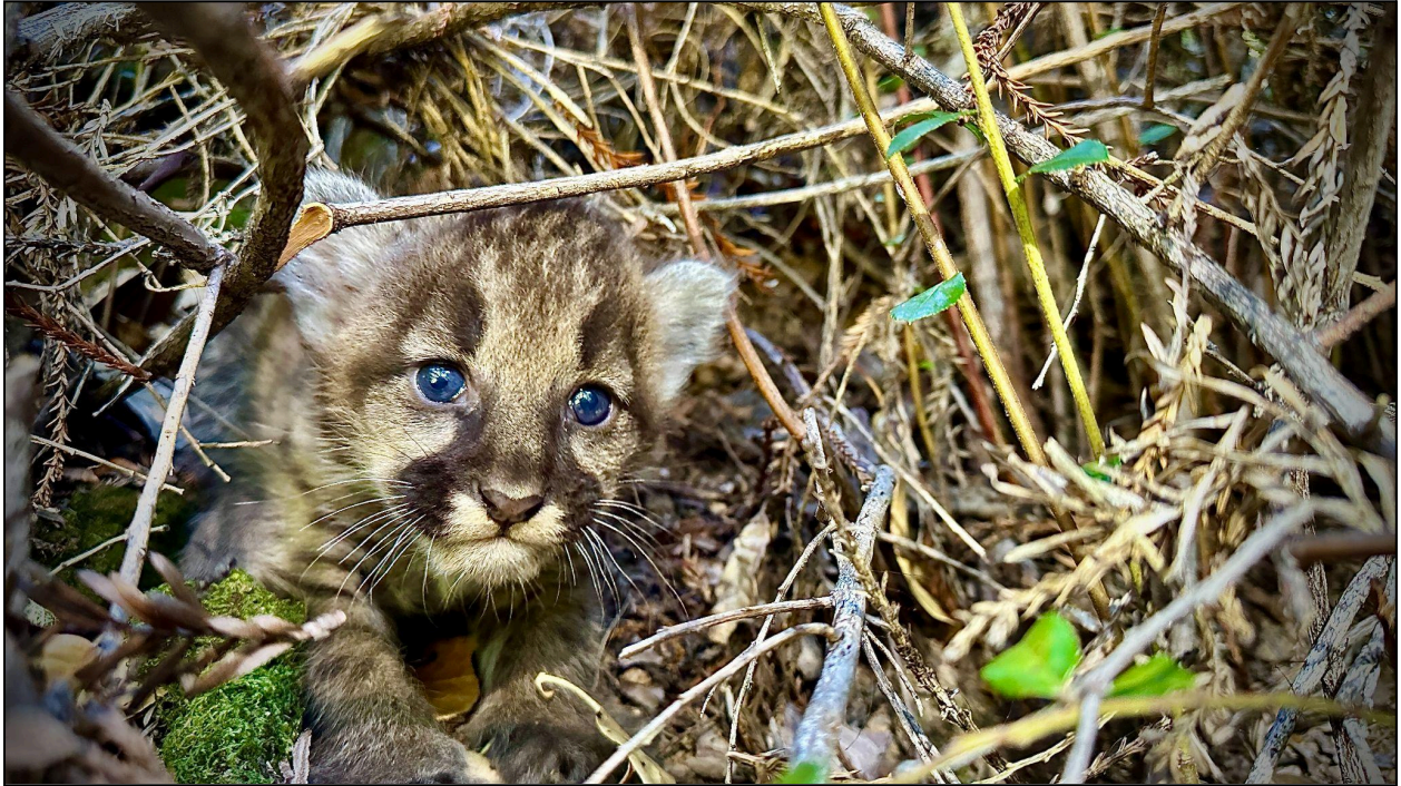
Fig 1. There's a new kid in town...P39's latest kitten born on the 12th August 2024