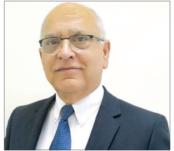
Khawaja ... increasing footprint

Through the tie-up Falcon will bring into the region, niche expertise and capability of subsurface engineering, production facilities management and turnkey drilling