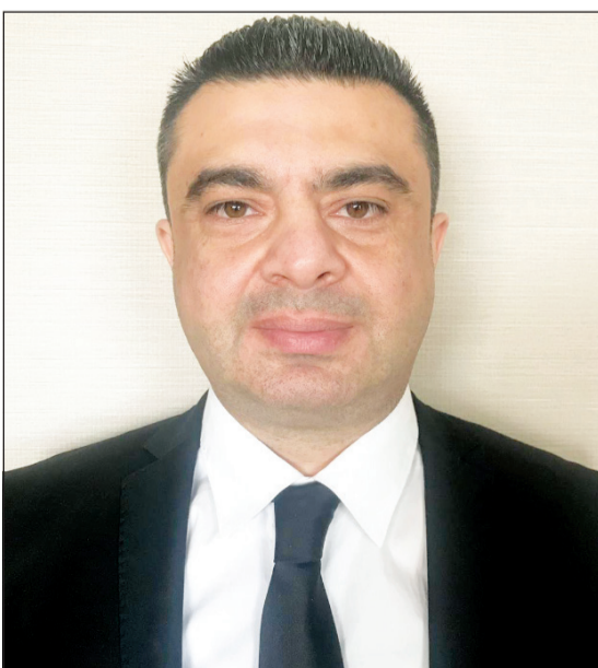
Ozavci ... targeting synergies