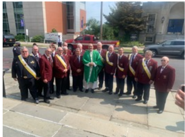
2021 Blue Mass at Saint Patrick's Church