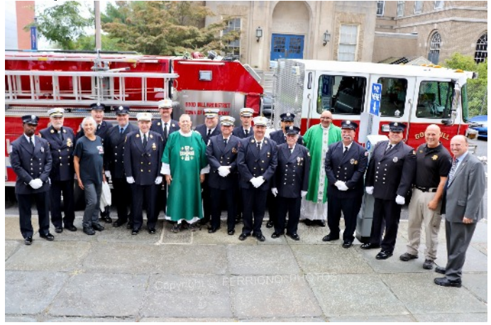
Our Blue Mass participants outside Saint Patrick's, at 55 Grand Street, Newburgh.