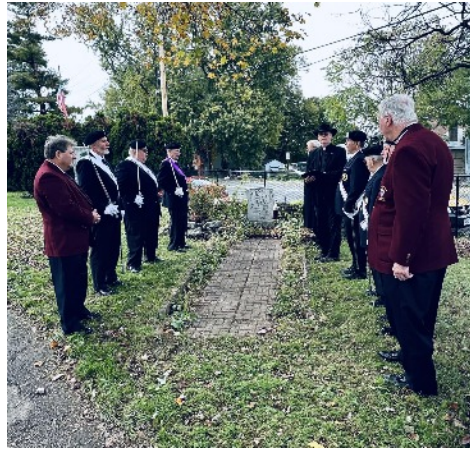
Re-dedication of the Council's Monument to the unborn.