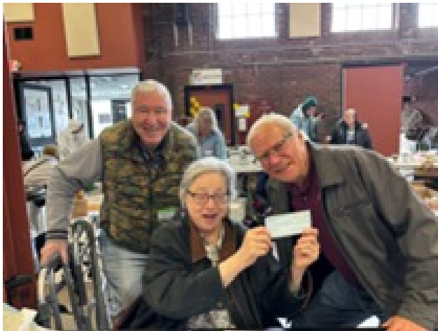
Presentation of our gift to Saint Mary's Outreach on April 19.

A Blessed and very happy birthday to the following council members who will be celebrating their birthdays in the months of May, June and July, 2024.