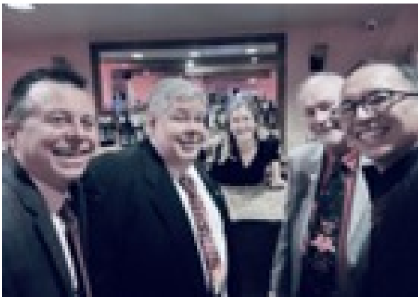
Saint Valentine's Day Dinner Dance

Stop by our special Anniversary Table at the Kennan L. Ryan Car Show More to come!