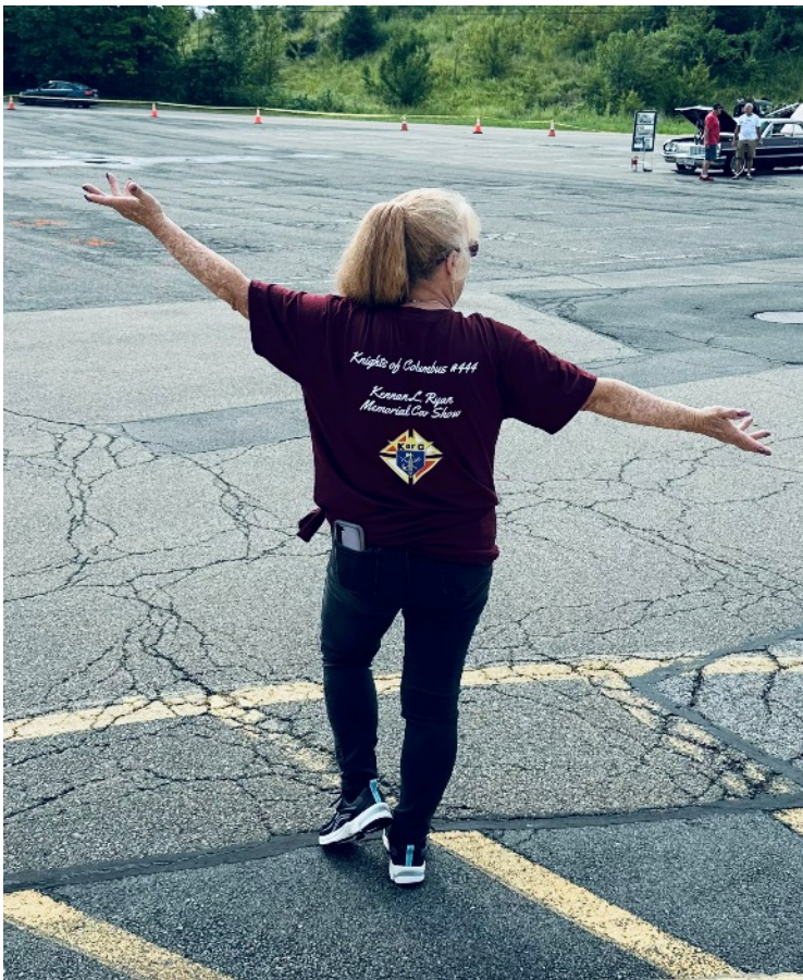
What it's all about!!