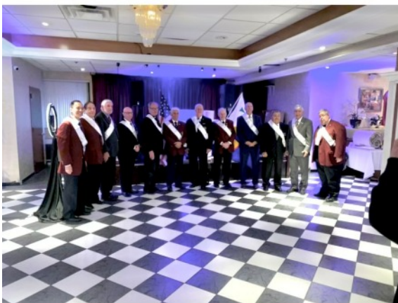
Past Grand Knights and Knights of the Year.

A Blessed and very happy birthday to the following council members who will be celebrating their birthdays in the months of November, December 2024, and January, 2025.