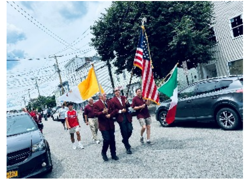
Members of our Council carrying the colors in the Italian Feast procession.