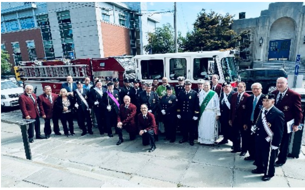
Blue Mass outside Saint Patrick's Church