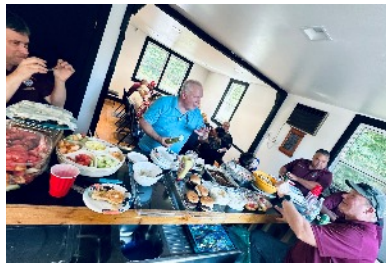
Founder's Day Picnic