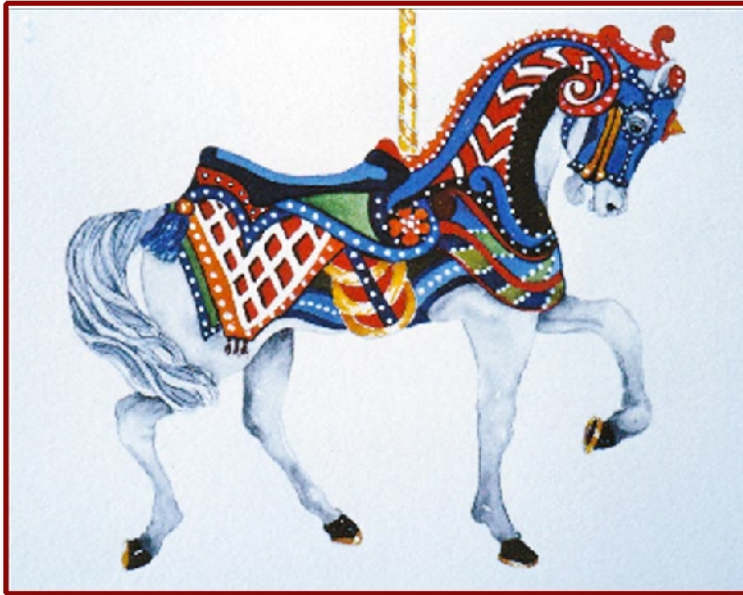
Sofia Medeiros "Merry"