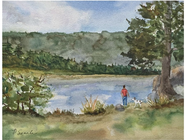
Norma Searle "Wow Montana"