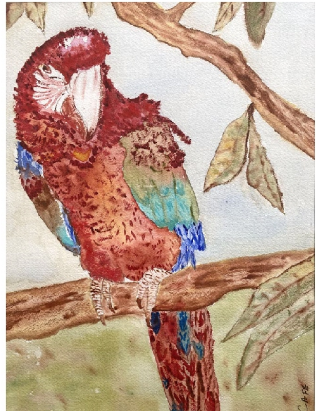
Carol Engelbrecht "Untitled"