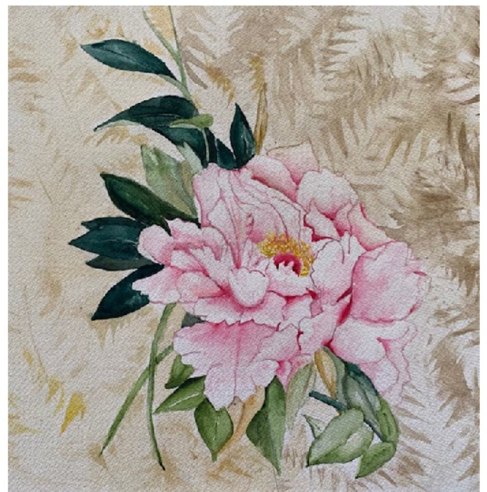
Kerstin Rounds "Peony"