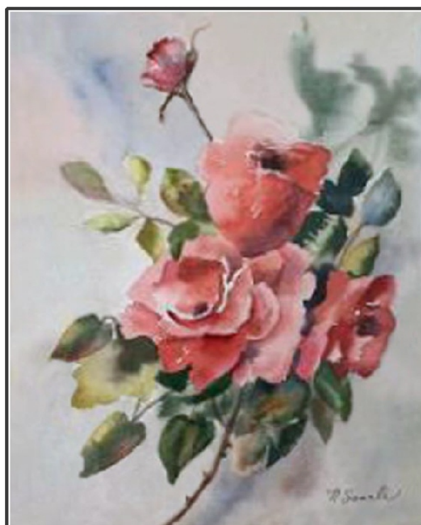
Norma Searle "Floral"