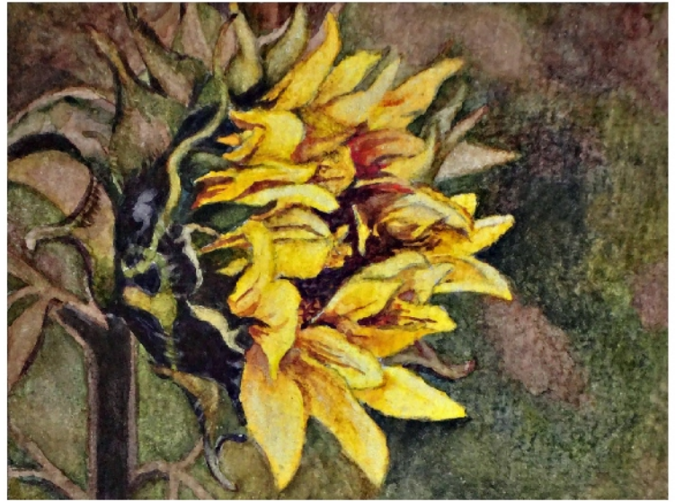
Diana Day Glynn "Lone Sunflower"

Images are owned by the artists and may not be copied or used in any way without permission.