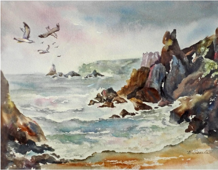
Norma Searle "Oregon Coast"