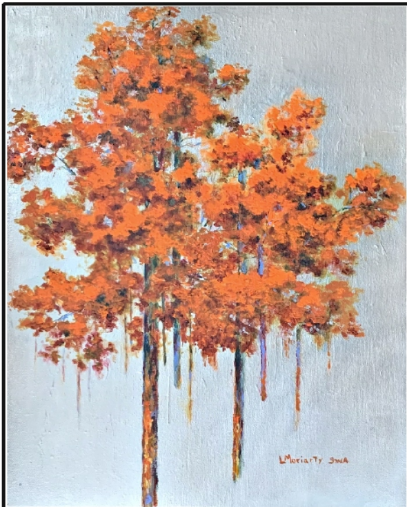
Leona Moriarty "Love the Light"

Images are owned by the artists and may not be copied or used in any way without permission.