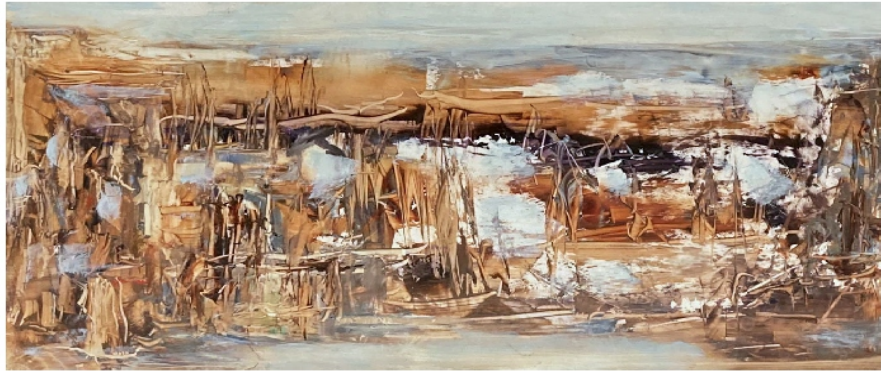
Olga Parr "Abstract #2"