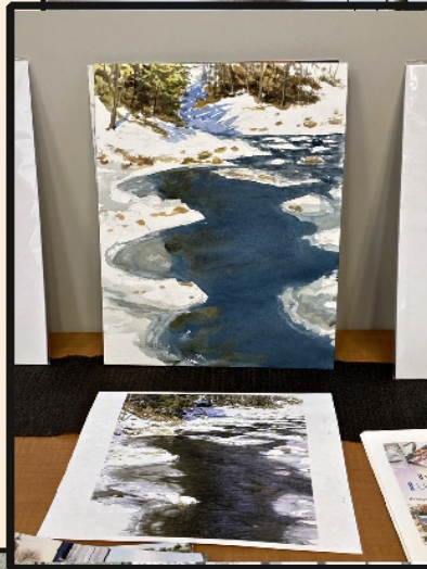
Above: Check out the big screen showing the demo. Left: Rafael's finished painting and his reference photo laying flat on the table. Below: Look at the size of that group & on a rainy day.