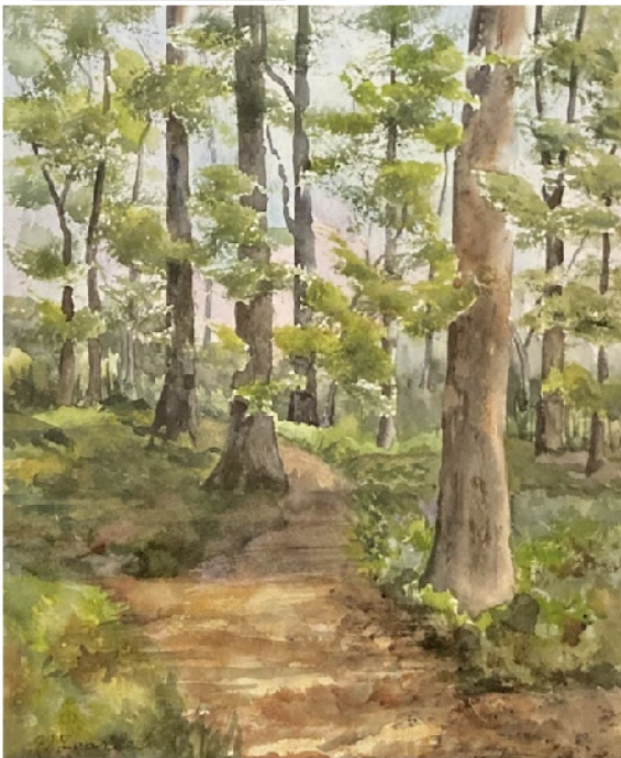
Norma Searle "Perfect Trail for a Walk"