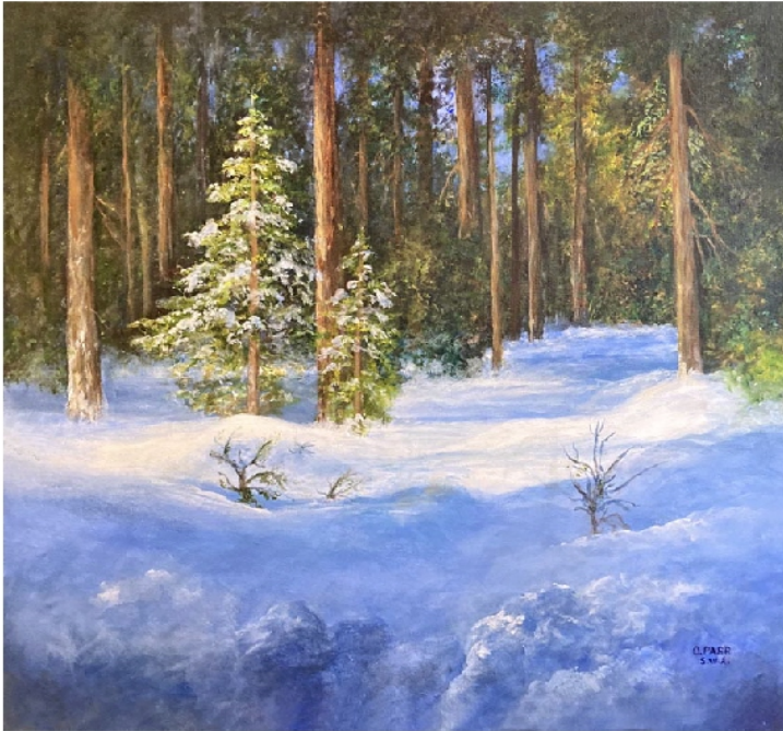
Olga Parr "Tahoe Christmas"