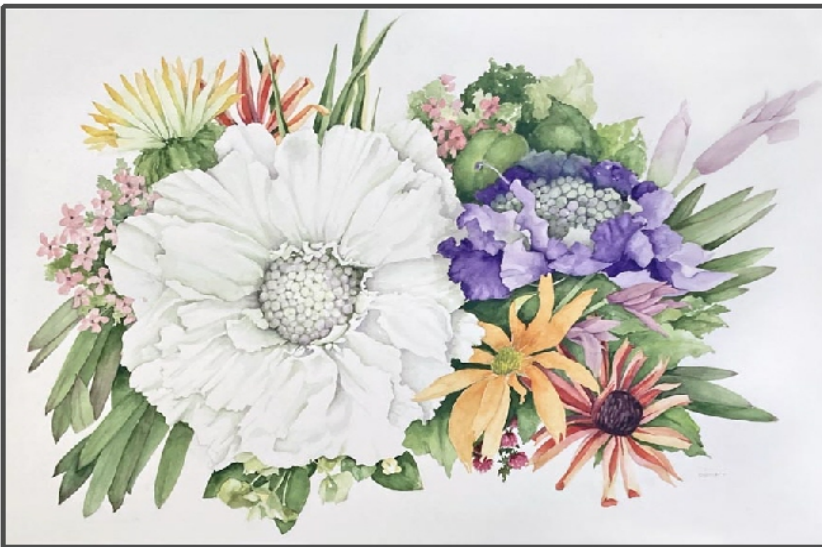
Pat Barr "Karen's Garden"