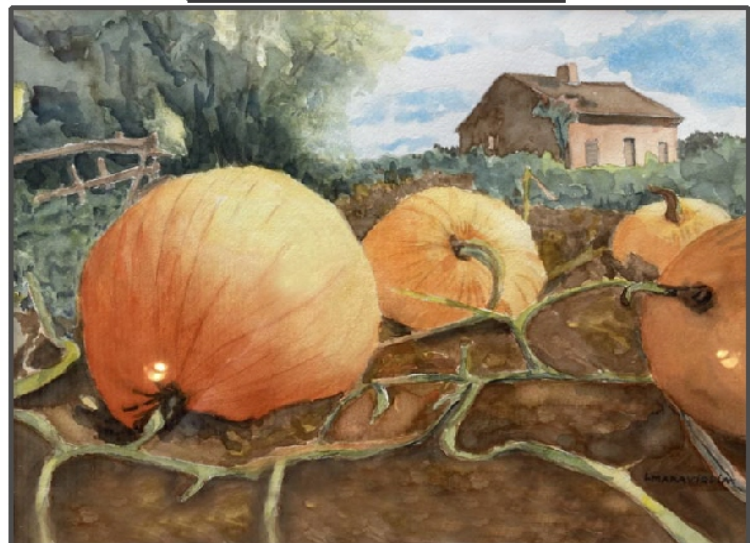
Lou Maraviglia "Pumpkin Patch"