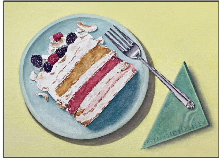
Diana Day Glynn "Sweet Indulgence"