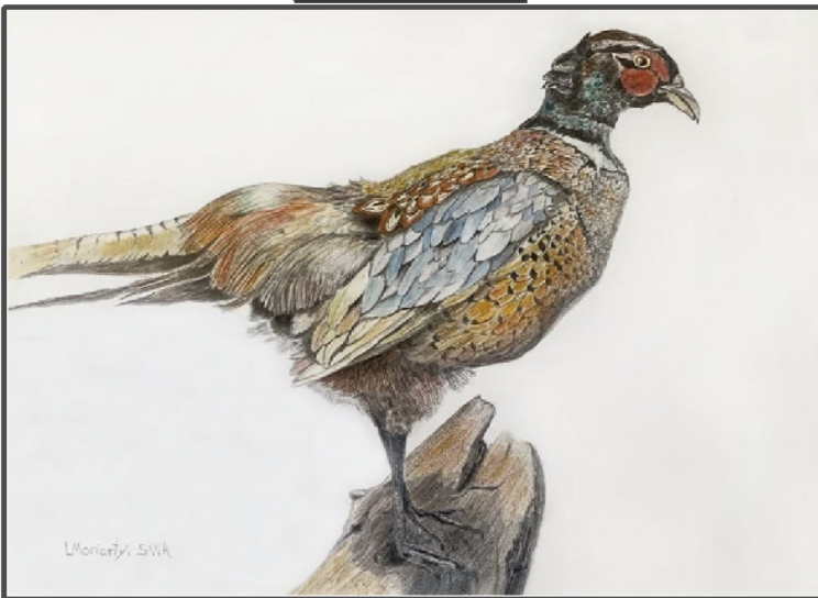
Leona Moriarty "I'm Stuffed"