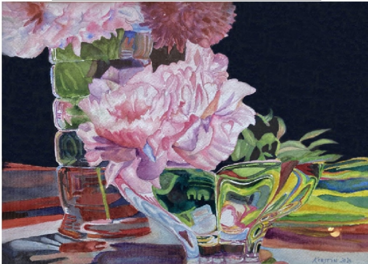
Kerstin Rounds "Reflections"