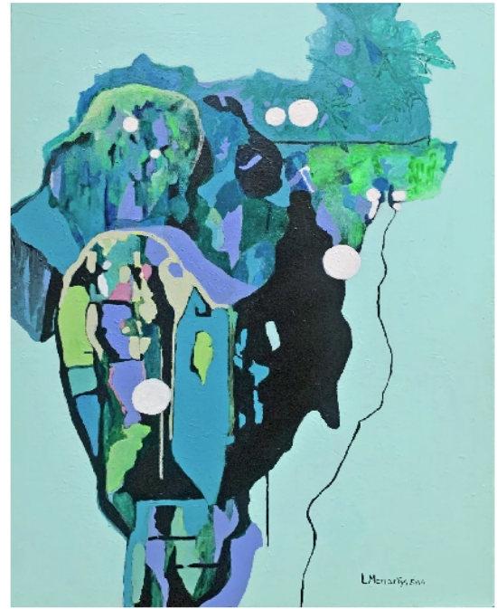
Leona Moriarty "Lotts a Color"