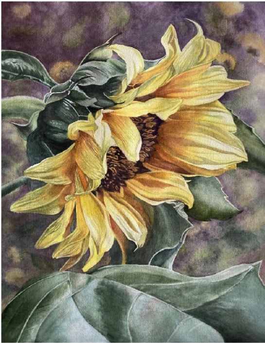
Diana Day Glynn "Sunflowers Embrace"