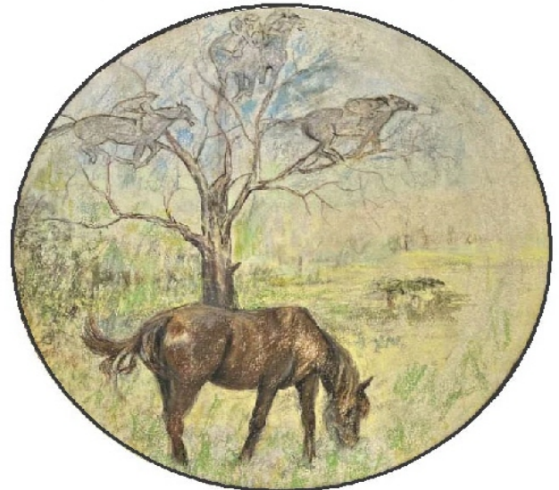
Olga Parr "My Last Race"