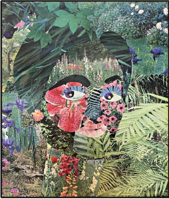
Susan Pizzi "Flower Girl #2"