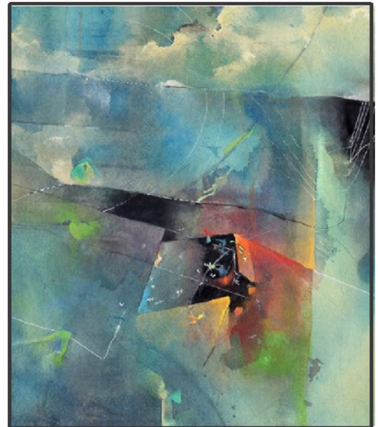
Map of Tiny Thoughts