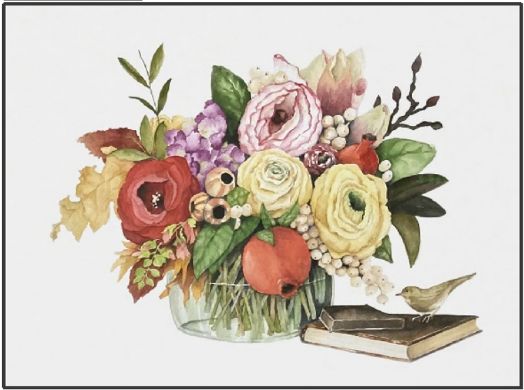
Pat Barr "Fall Flowers"