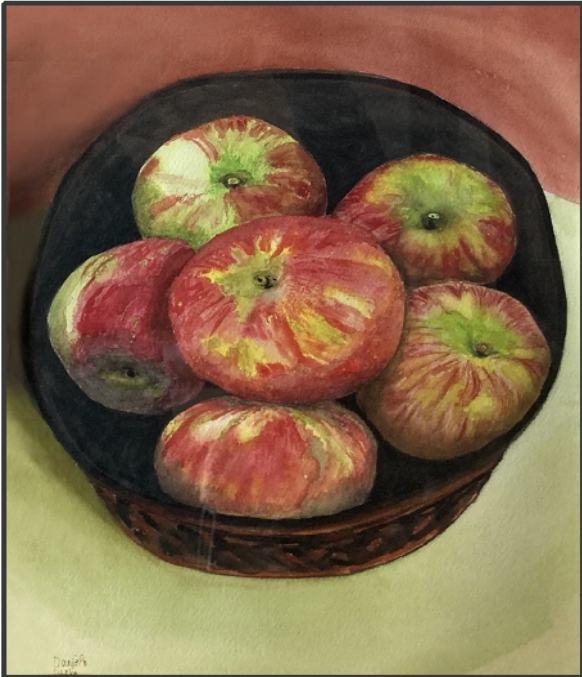
Danielle Cuzin "Apples Basket" (Watercolor)