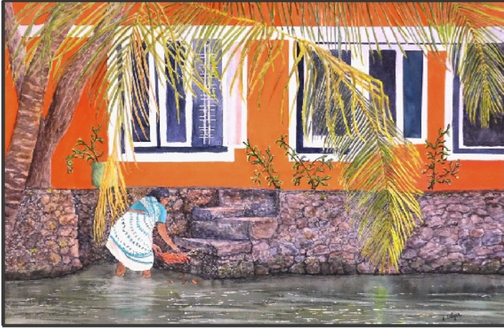
Barbara Alger "Keral Canal" ((Watercolor))