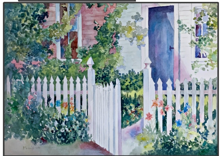
Leona Moriarty "Blue Door" (Watercolor)