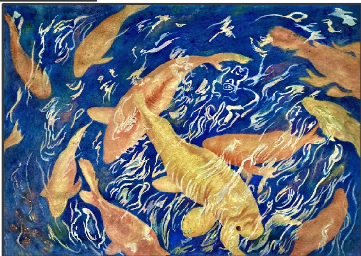
Diana Day Glynn "Feeding Time" ( Watercolor )