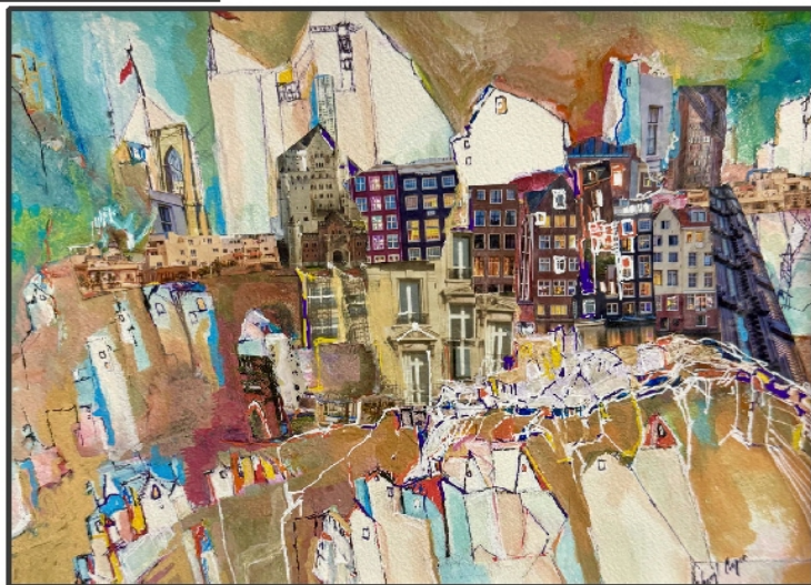
Cheryl Cooper "Windows" ( Mixed Media )