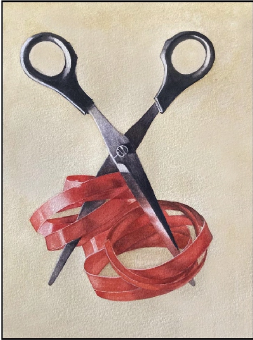
Diana Day Glynn "Ribbon Cutting" (Watercolor)