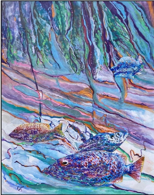
Cheryl Cooper "Underwater Scene" (Gouache/Collage)