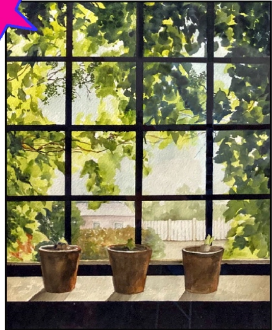
Pat Barr "Spring Window" (Watercolor)