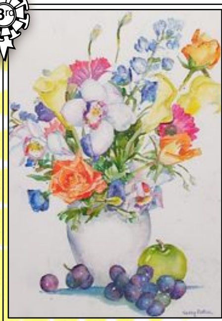
3rd Place "Floral #7" by Sally Patton