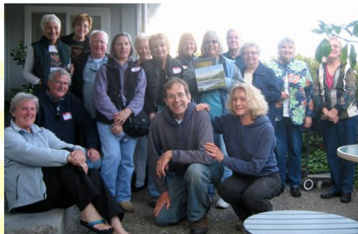
Please see BAS website for larger view.