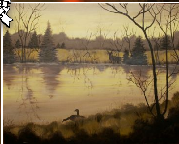
2nd Place "Morning Light" by Giulia Colton