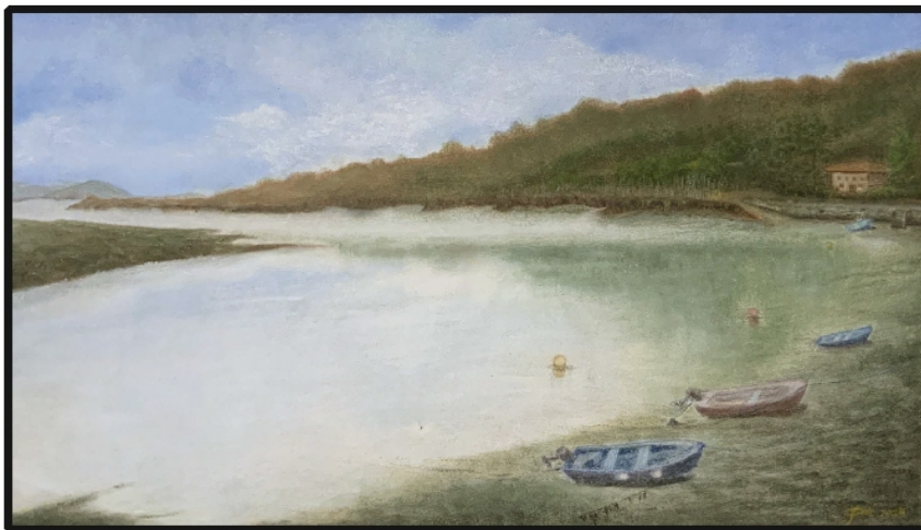
Pié Siron "Boats at Low Tide" (Pastel)