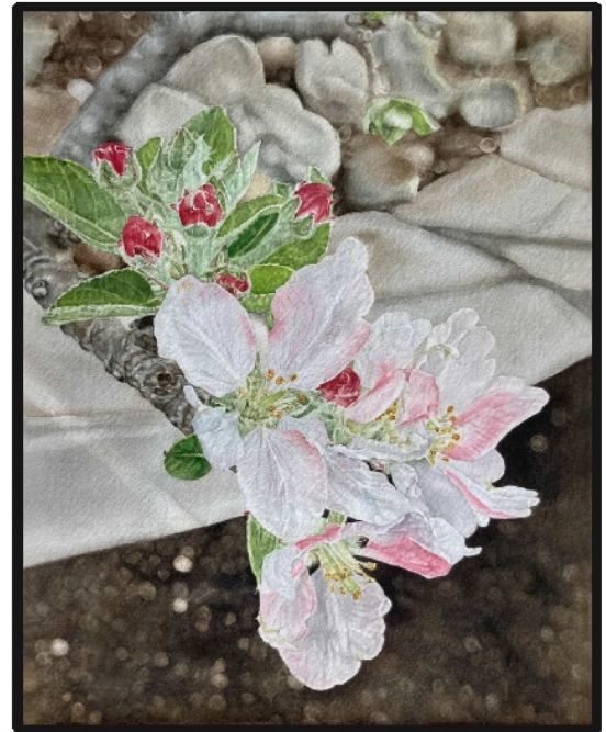
Nicole Joshi "Apple Blossom" (Watercolor)