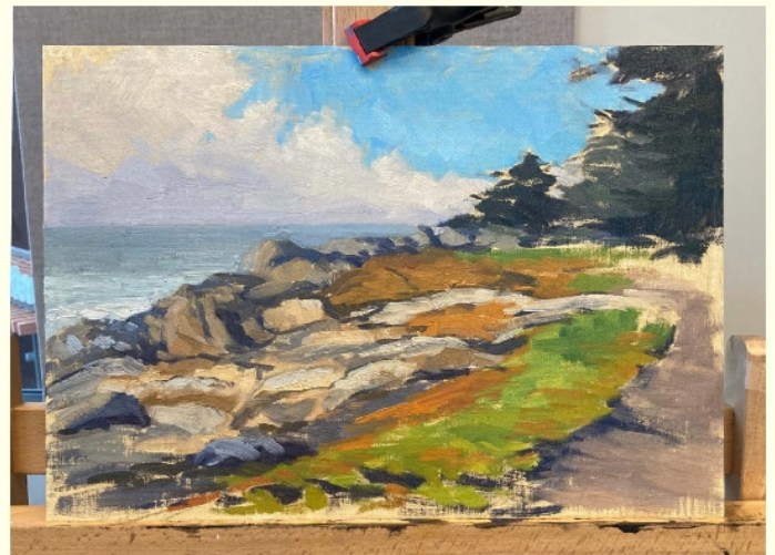
Scott's demo painting of Pescadero Point