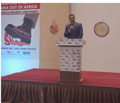
DR DEREJE DUGUMA, STATE MINISTER OF HEALTH

The stimulating conversations, crucial perspectives, and substantial results that arose from this occasion reaffirmed our joint dedication to furthering the advocacy for epilepsy on a global scale. Particularly noteworthy was the establishment of the Call to Action, signifying a momentous achievement and underscoring our mutual resolve to tackle the pressing issues confronting individuals impacted by epilepsy. The team also had the pleasure of dining at one of Addis Ababa's renowned traditional restaurants, savoring the rich flavors of Ethiopian cuisine. Additionally, they had the opportunity to visit the CareEpilepsy Center, witnessing firsthand the impactful work being done to support individuals living with epilepsy.