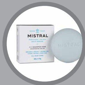
2-1 SHAMPOO BAR