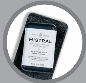
PURIFYING BODY BAR