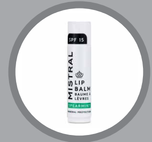
SPF LIP BALM