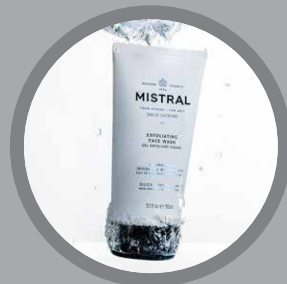
EXFOLIATING FACE WASH