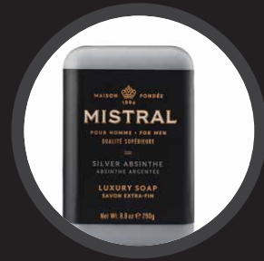
PREMIUM FRENCH MILLED BAR SOAPS