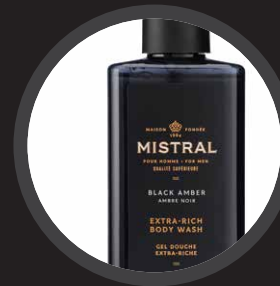
HAND & BODY CARE