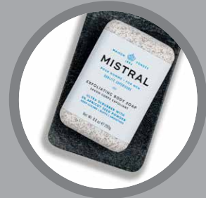
ULTRA EXFOLIATING BAR