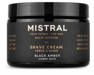
BLACK AMBER: MMSHTBA