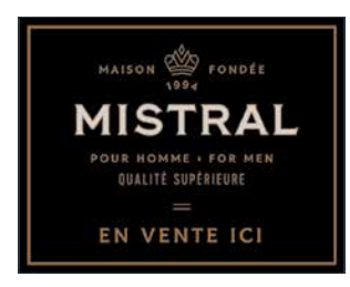
SIGNAGE: MSDS Printed and laminated on aluminum composite, grommets in 4 corners 14" WIDE X 11" HIGH