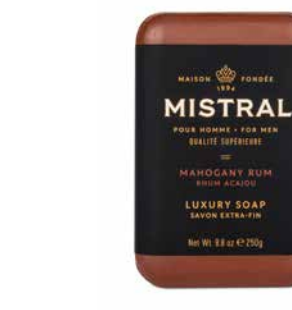
MAHOGANY RUM: MS8MR