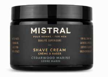
CEDARWOOD MARINE: MMSHTCM