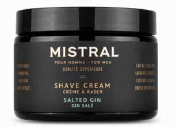
SALTED GIN: MMSHTSG