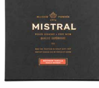
BOURBON VANILLA: MMPGSBV