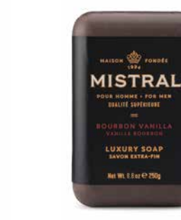
BOURBON VANILLA: MS8BV *EXFOLIATING