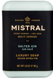
TRAVEL SIZE BAR SOAP SALTÉD GIN: 2.8 OZ • 80 G | MS2SG