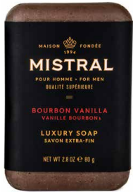
TRAVEL SIZE BAR SOAP BOURBON VANILLA: 2.8 OZ • 80 G | MS2BV