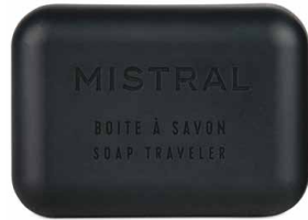
SILICONE SOAP CASE FOR 2.8 OZ BAR: MS2TC