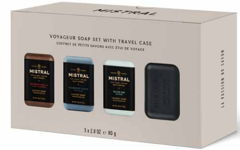
VOYAGEUR SET WITH TRAVEL CASE CONTAINS THREE 2.8 OZ BARS: BOURBON VANILLA, CEDARWOOD MARINE, AND SALTED GIN • A SILICONE TRAVEL CASE

This set is an ideal gift or companion for those who value clean design, clean skin, and clean getaways.