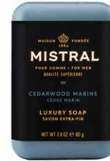
TRAVEL SOAP CEDARWOOD MARINE: 2.8 OZ • 80 G | MS2CM

ELEVATE YOUR TRAVEL EXPERIENCE WITH NEW ADDITIONS TO OUR VOYAGEUR COLLECTION.