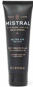
SALTED GIN: MMPS80SG