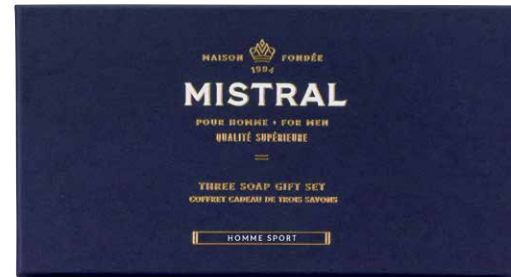
THREE SOAP GIFT SET CONTAINS THREE 7 OZ BARS: RIDE VENTOUX, GOLF VALBONNE, AND SURF HOSSEGOR