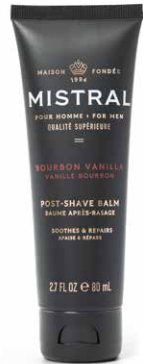
BOURBON VANILLA: MMPS80BV