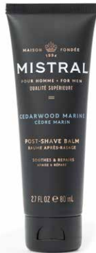
CEDARWOOD MARINE: MMPS80CM